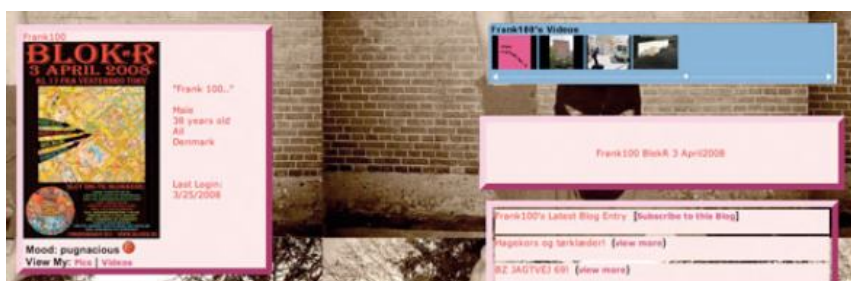
Fig 2. MySpace account using a poster promoting the protest event 'Blok action' in 2008 in the profile picture.

In addition, Myspace and Facebook profiles seem to have yet another function in the way they are used - much resembling that of a flyer. Only with the advantage over regular paper flyers that digital flyers comes with a personal endorsement – a recommendation from someone within the activist's own network.