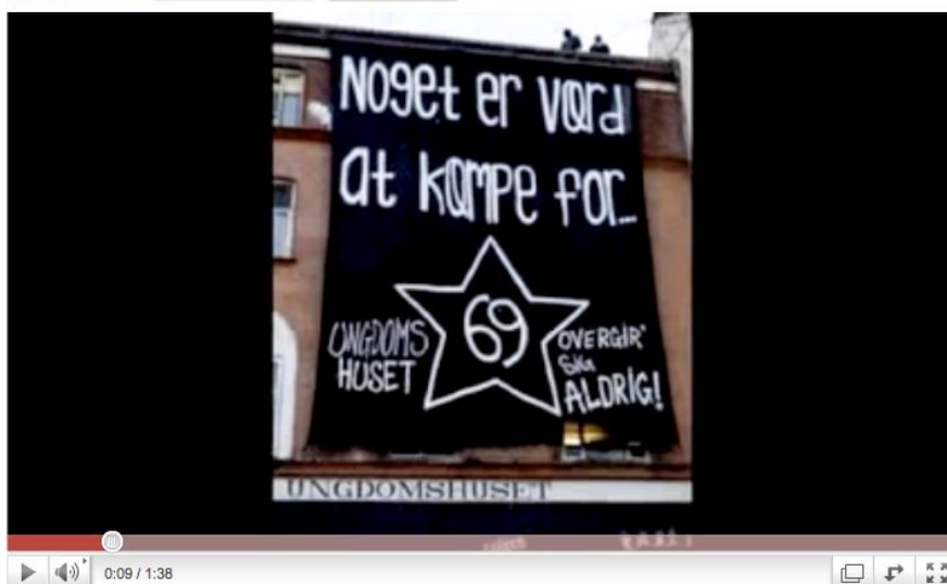
Fig 1. Opening image from the video 'Ungeren Blir': The text reads "Some things are worth fighting for. The Youth House '69' We will never surrender."

However, the myriad voices on YouTube are not in unison as these videos paying homage to the movement are juxtaposed on the very same platform with videos condemning the activists and their cause. The video 'Nej til Ungdomshuset' (No Youth House), draws upon the same kind of imagery as the videos supporting the event. The music used is from a German Neo-Nazi hard rock group vowing to fight for the Fatherland against intruders, and it is difficult to know whether the intent of the sender is to picture the movement as fascist in a pejorative way or if the sender is him- or herself a fascist. This kind of dissonance where seemingly conflictual material appears side by side and is specifically characteristic of YouTube demonstrating the multifaceted nature of such sites, a polyphony of mainstream, alternative, hegemonic and potentially subversive clips (Christensen, 2008: 156).