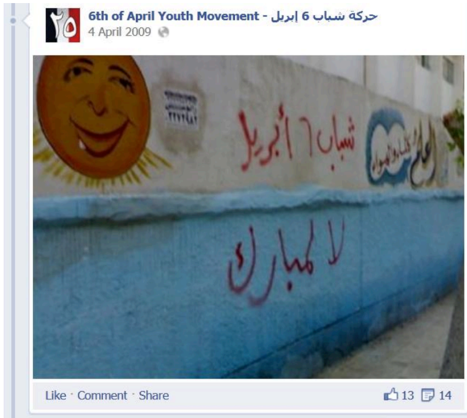
April 6 th Youth Movement Facebook page, 4 April 2009 Anti-Mubarak graffiti, reading, “April 6 th Youth... No to Mubarak.”

Likewise, when asked about their goals in the period of 2005-2010, interviewees responded, “Mubarak. It was crystal clear... Mubarak was the main concern” (I3b) and “we don’t want Mubarak and his son and his police minister and his foreign minister... we don’t want these billionaires and this system” (I19). This is not to say that the activists had no specific change-related political demands; on the contrary, the movement largely supported ElBaradei’s seven points for change in the electoral law and the management of electoral instances. However, as with socio-economic changes, the specificities came from outside the movement, who was instead contented to lend its support to the initiatives of others.