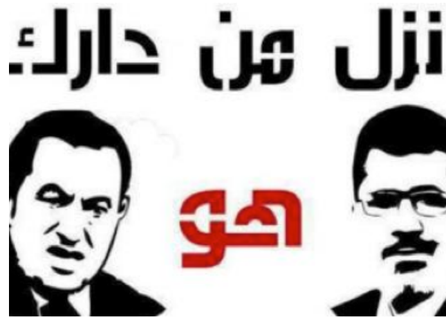
“Leave your house. Morsy is Mubarak.” Abou-El-Fadl, 2013

15 August 2013; 16 August 2013), and in graffiti and other visual symbols that made explicit this equivalence, for example superimposing the faces of Mubarak and the faces of Morsy and al-Sīsī.