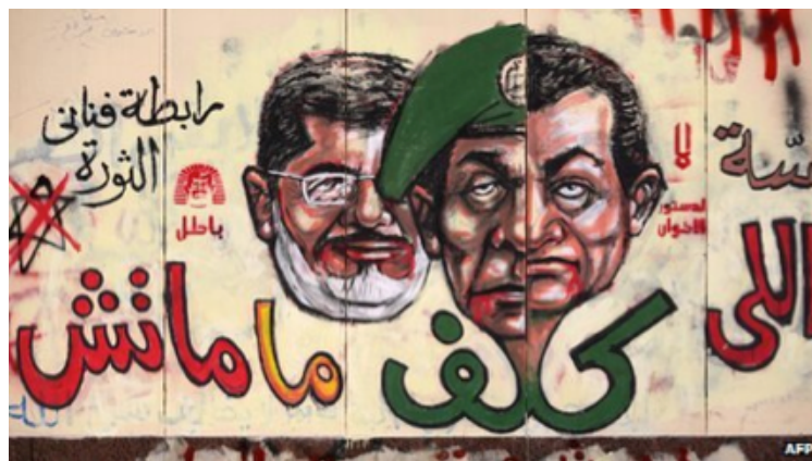
Depiction of the military, Mubarak, and Morsy. AFP, 2013