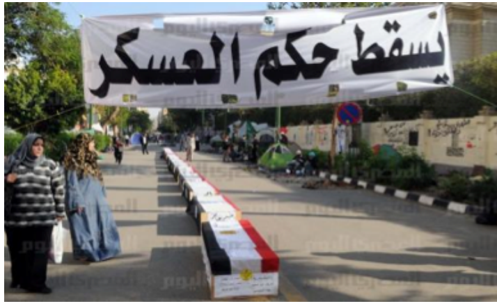
Symbolic coffins draped in Egyptian flag. Sign reading “Down with military rule.” Egypt Independent, 2012d