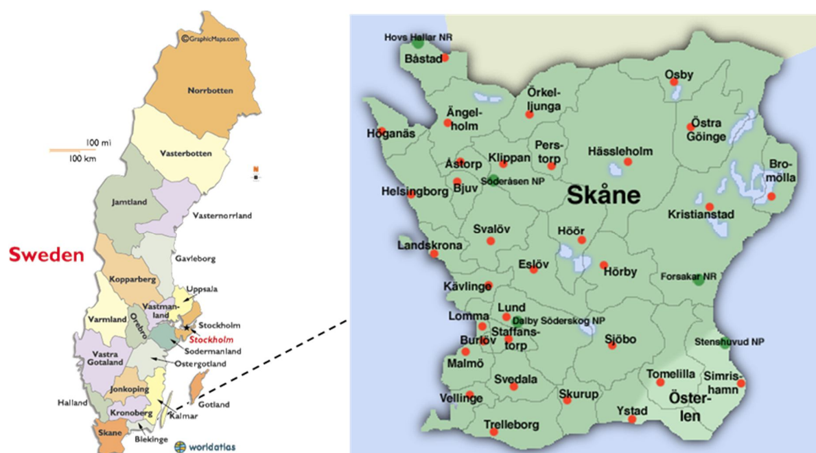
Figure 1: Map of Sweden (left) and Skåne (right). The maps were collected from Worldatlas ( http://www.worldatlas.com/webimage/countrys/europe/lcolor/secountries.gif ) and Naturproduktion Bengt Hedberg ( http://www.naturproduktion-bh.se/maps/skane.gif ).