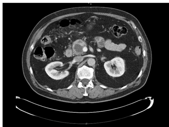
Figure 1 Abdominal computer tomography showing the lesion in the head of the pancreas.

Endoscopic ultrasound coupled with fine-needle aspiration has enabled not only the detailed examination of pancreatic cystic lesions but also cytological, biochemical and immunocytological analysis [12]. A previous report by Kongkam et al. [6] could not identify any unique endoscopic ultrasound finding in cystic neuroendocrine tumors although others have suggested that cystic neuroendocrine tumors exhibit more frequently a thick wall compared to mucinous cysts [12]. Anyhow, the most important