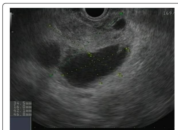
Figure 2 Endoscopic ultrasound image revealing a cystic lesion with regular well-demanded borders in the head of pancreas.

Neuroendocrine tumors account for only 1-2% of all pancreatic neoplasms and less than 10% of all neuroendocrine tumors are cystic, which makes cystic neuroendocrine lesions very rare [6]. The mean age at diagnosis is 53 years and there is no evident gender predilection [7,8]. Most cystic neuroendocrine tumors in the pancreas are non-functional and the diagnosis is usually made incidentally or secondary to mass-dependent symptoms, such as abdominal pain, nausea or weight-loss, as was the case in our patient. Except for neuroendocrine microadenomas, all neuroendocrine tumors are considered to