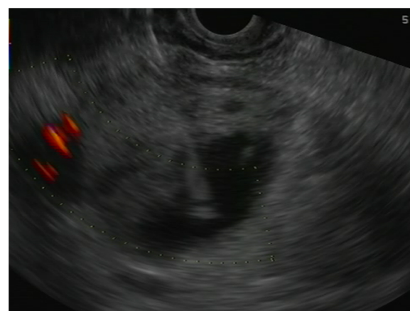
Figure 3 Endoscopic ultrasound image showing the fine-needle aspiration (22 Gauge) of the cystic tumor. The tip of the needle is in the cystic component of the lesion.