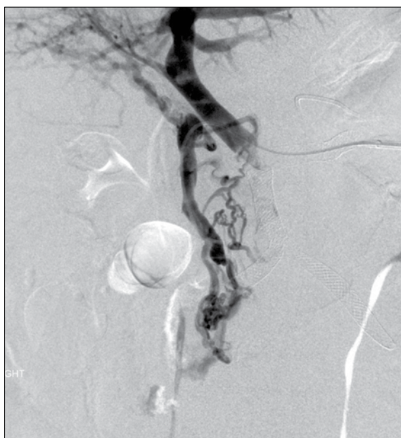
Figure 1. Trans-splenic access with stent placement in narrowed splenic vein and portal veins. Blood flows from mesenteric veins to periportal collaterals.

Paracentesis was performed in patients with a significant amount of ascites prior to the endovascular procedure. Transjugular access to the portal circulation was attempted initially using Rosh-Uchida transjugular liver access set (William Cook Inc, Bloomington, IN). When the portal vein