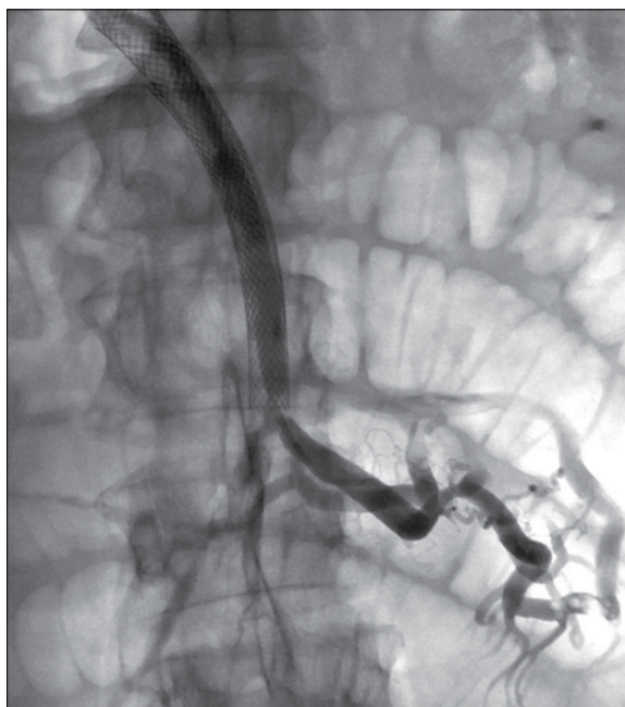
Figure 5. Improved flow through the SMV and the left jejunal branch after stenting and endovascular thrombectomy.

The majority of the patients showed documented short-term clinical success with complete resolution of initial symptoms in seven patients. Three of the patients had patent stents and three had occluded stents at the end of the observation period. One patient died the day after the