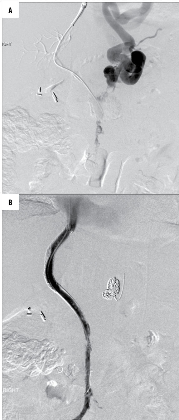
Figure 2. Access through the thrombosed portal vein. (A) Outflow through the enlarged left gastric vein. (B) Final venogram after endovascular thrombolysis and stenting of SMV, portal vein and TIPS placement. Some residual thrombus in SMV and TIPS, no flow through the embolized left gastric vein.

Mechanical thrombectomy procedures included suction of the thrombus using a 6–8 F guiding catheter (Cordis), power pulse thrombolysis (Angio-Jet, MedRad, Warrendale, PA) with heparinized saline and/or tissue plasminogen activator (TPA), and the over-the-wire Trerotola device (Arrow, Reading, PA) in patients with acute thrombus. Angio-Jet and Trerotola devices were chosen based on the availability of the product in the angiography suite. The patients with acute thrombus poorly responsive to initial treatment