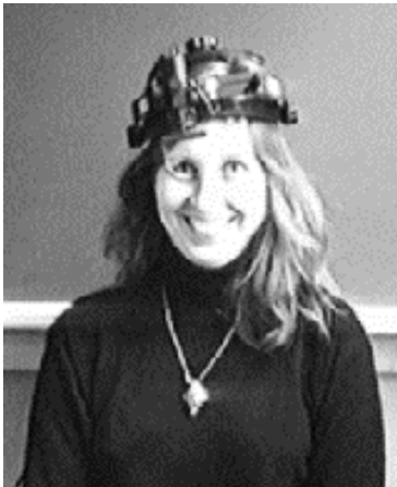
Figure 1. The SMI iView headset.