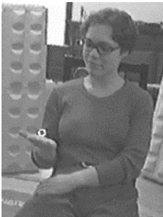
Figure 5. A speaker's auto-fixation followed by a listener-fixation of the same gesture.