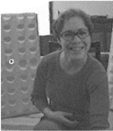
Figure 3. Avoidance fixation.