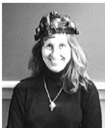
Figure 1. The SMI iView headset.