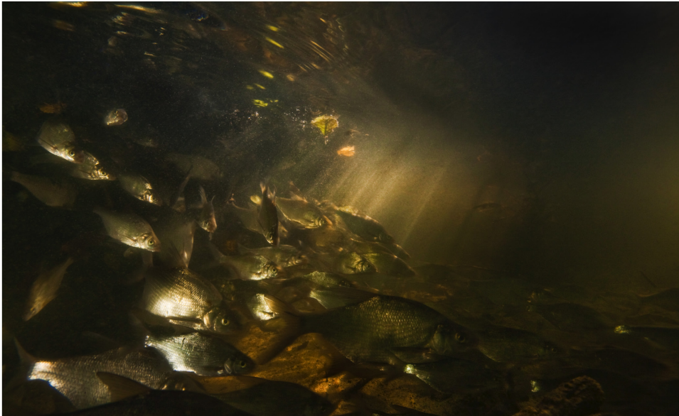
Fig. 1. Cyprinid fish start to leave our study lakes on behalf of connected streams during early autumn and when winter's grip is firm, thousands upon thousands of fish resides in the streams

availability relative to predation risk (Brönmark et al. 2008). The latter form has received the most attention and is the subject of my thesis. Our study lakes are small, shallow and moderately eutrophic lakes situated in southern Sweden and southern Jutland, Denmark, respectively. Our model organism, roach ( Rutilus rutilus ), a common freshwater fish and a partial migrant, start to leave the lakes via connected streams during early autumn, and a significant fraction (up to c 70%) of the roach population resides in the streams when winter's grip is firm, whereas other individuals remain as residents in the lake year-round. The stream wintering grounds hold low densities of stationary piscivorous predators and the vast majority of the pike populations in the lakes do not follow the migratory prey into the stream habitat (Skov et al. 2008,