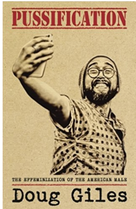
Fig. 7. Doug Giles, Pussification . White Feather Press 2016. Amazon.com, https://www.amazon.com/Pussification-Effeminization-American-Doug-Giles/dp/1618081454

Male features an image of an Asian-looking man on the cover, grinning broadly and taking a selfie (Giles, fig. 7). 24 The unspoken implication is clear: Asian men, as a broad category, exemplify effeminate masculinities that many in the alt-right loathe and fear. 25