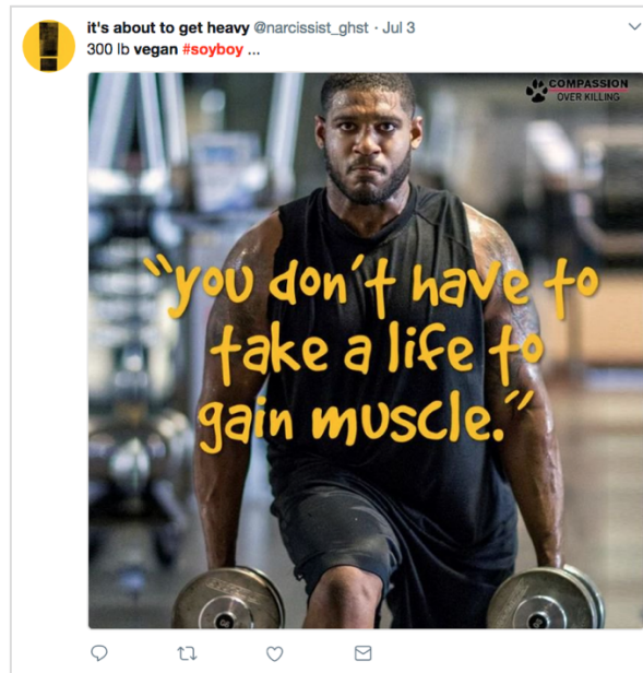
Fig. 10: '300 lb vegan #soyboy'. Twitter.com , 3 July 2018, https://twitter.com/narcissist_ghst/status/1014233764552232960 .

The #SoyBoy hashtag is sometimes used in more generic posts by the vegan community, accompanying images of vegan food. 37 Like the athlete, bodybuilding, and other #SoyBoy tweets depicting stereotypically masculine men, the point of these tweets appears to be to create a narrative where a vegan 'soyboy' lifestyle can be not only sufficient but even superior to a dairy-and-meat-based diet, even for strong masculine western men (or women). 38