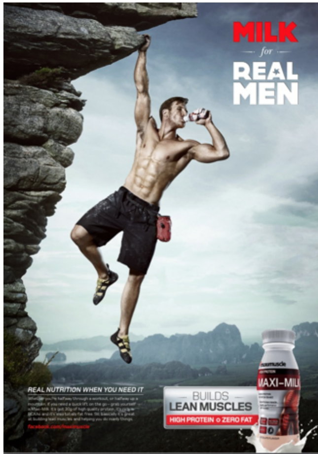
Fig. 3: ‘Milk for Real Men’. Maxi-Milk, USA, 2012; SeanLerwill.com, 30 Aug. 2012, http://www.seanlerwill.com/maximusclemaxi-milk/ .

As the next section discusses, the alt-right also uses milk to construct tropes of ‘milk masculinities’, with dairy being used to exemplify whiteness and virility and plant milk – in particular soy milk – being used as a symbol of weakness and emasculation.