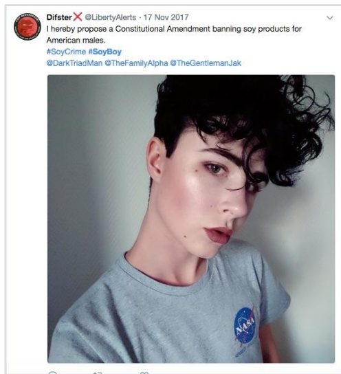
Fig. 5 ‘Constitutional Amendment’. Twitter.com, 17 November 2017. User account suspended.

As with the ‘effeminate rice eater’ trope from colonial times, the trope of the emasculated ‘soy boy’ is associated not only with cherry-picked science but also of racist stereotypes linking broadly ‘Asian’-coded foods – rice and soy – to weakness and emasculation. That can be seen played out in a pair of #SoyBoy tweets (figs. 5 and 6). One, from November 17, 2017, depicts a pale, slender, dark-haired, man who some may consider vaguely ‘Asian’ in appearance wearing lipstick and eye makeup; the tweet says ‘I hereby propose a Constitutional Amendment banning soy products for American males.’ The other, dated October 5, 2017, depicts a pink-and-purple ‘feminine’ coded Japanese anime character with sparkling purple eyes; the character is holding a bottle of Soylent soy milk and the caption reads ‘Started buying @soylent for my son, he’s a bonafide #SoyBoy now!’