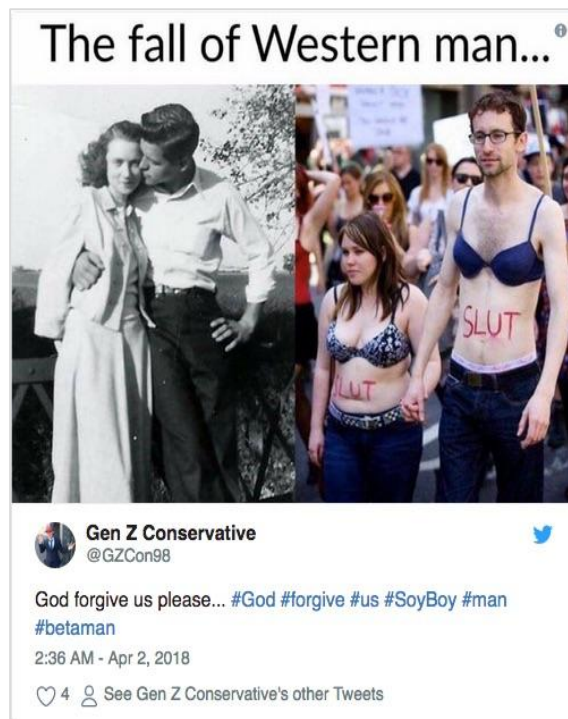
Fig. 8: ‘The Fall of Western Man’. Twitter.com, 2 April 2018, https://twitter.com/GZCon98/status/980604732870819840