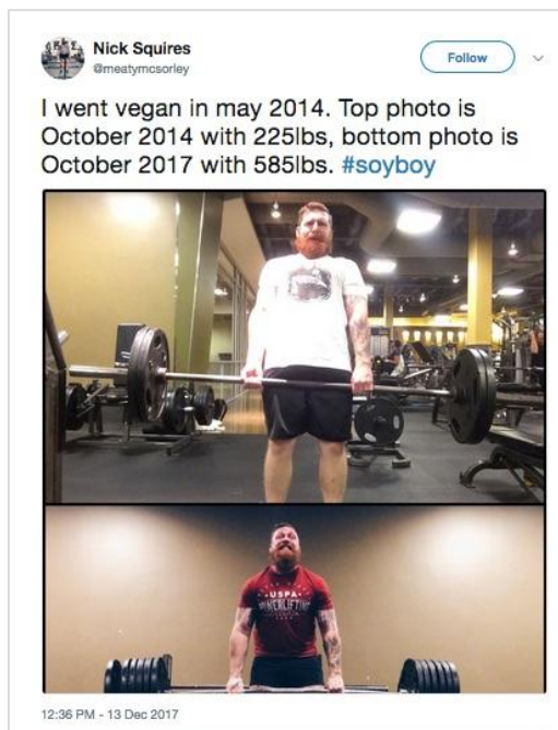
Fig. 9: Vegan Athlete. Twitter.com , 13 Dec. 2017, https://twitter.com/meatymcsorley/status/941044253240672256 .