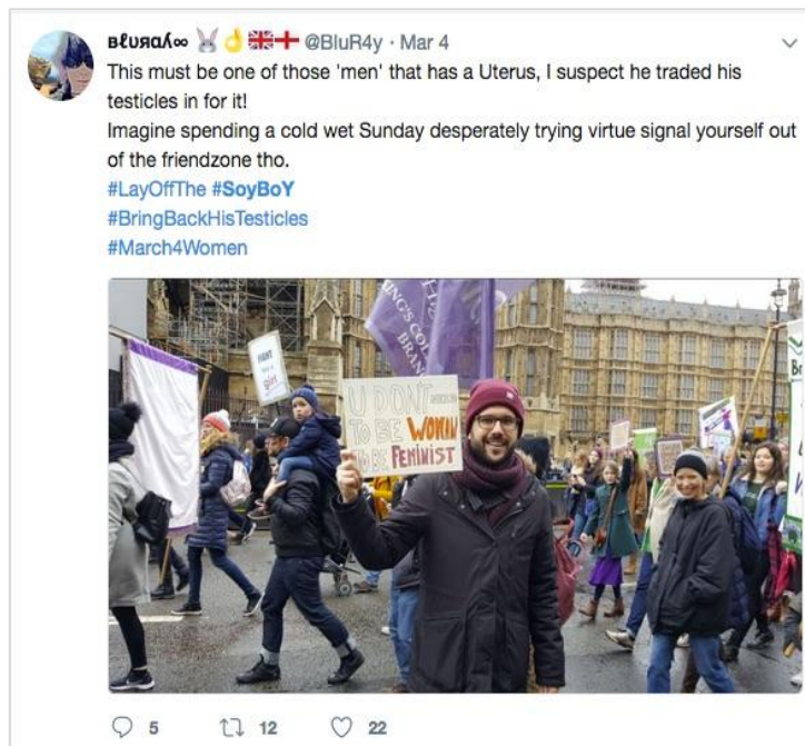
Fig. 4: ‘U don’t need to be a woman to be a feminist’. Twitter.com, 4 March 2018, https://twitter.com/BluR4y/status/970314826890260485 .

A tweet from October 2017 illustrates how soy is seen as a transmitter of weakness whether it is consumed or not, claiming that ‘Soy is a metaphor for weakness. One can be a soyboy even if soy milk never passes his lips.’ 22 Similarly, a tweet from March 4, 2018 illustrates the idea of a ‘soy boy’ being used as a metaphor for emasculation (fig. 4). Depicting a man at what appears to be a women’s rights march smiling proudly holding a ‘U don’t need to be a woman to be feminist’ sign, the caption states, ‘This must be one of those ‘men’ that has a Uterus, I suspect he traded his testicles for it!’ #LayOffThe #SoyBoY #BringBackHisTesticles #March4Women. 23