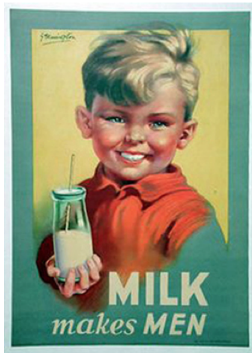
Fig 1. 'Milk Makes Men'. USA, 1930s; Josh Harkinson, 'The Scary New Science That Shows Milk Is Bad For You', MotherJones.com , Nov./Dec. 2015 issue, https://www.motherjones.com/environment/2015/11/dairy-industry-milk-federal-dietary-guidelines/