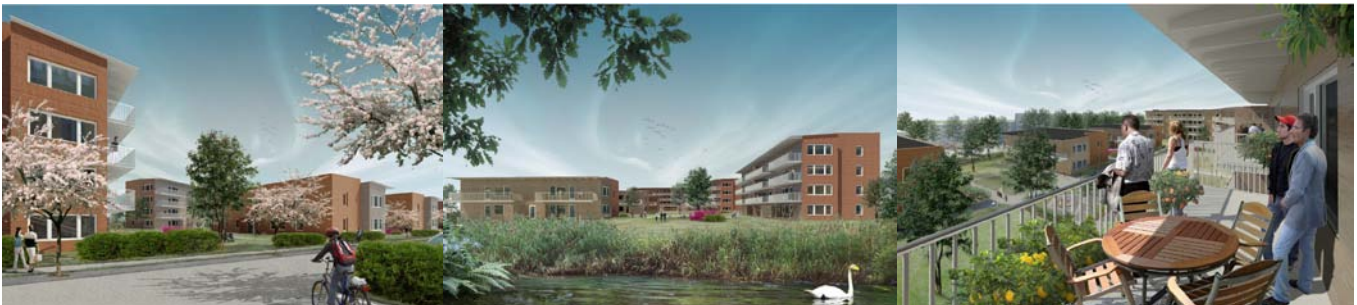
Figure 1: Gyllins Trädgård - Marketing Images (White Architects)

At Gyllins Trädgård MKB Fastighets AB plans to build 87 residential units for rent within 9 buildings of 2 to 4 storeys. The project will include 2, 3 and 4 room apartments between 62 and 95 m 2 . MKB, have provided the project consultants with a CAD-coordination manual which stipulates the client's expectations with regards to the use of 3D design tools and for some of the design team members it is the first occasion of working with 3D coordinated models.