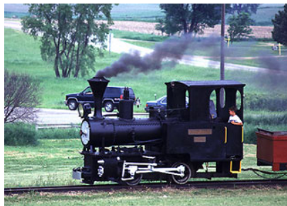
Steam Locomotive Hibernia AG No. 7

In the case of outdated technologies as the steam locomotive; the problem deserves a deeper analysis because there is nothing wrong with their noematic and their pragmatic aspects. These levels work “properly” notwithstanding that these technologies, are useless . Time- or historical-brokenness cannot be explained in terms of noematic and pragmatic aspects nor with reference to their onticality or ontologicity.