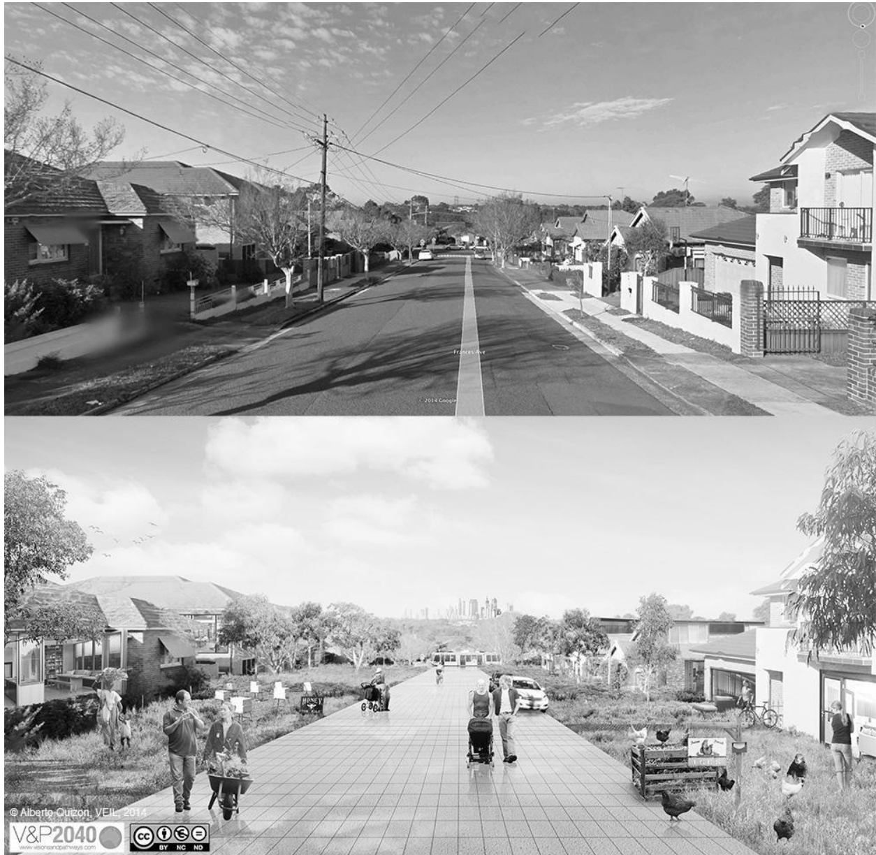
Image 1: The transition of a typical Australian street from 2014 to 2040

changes. These glimpses are produced by professional designers who attended the visioning workshops. When the glimpses are opened to public gaze they are accompanied by short interpretive statements that will evolve based on dialogue and as the project team constructs more systematic categorisation of future scenarios V .