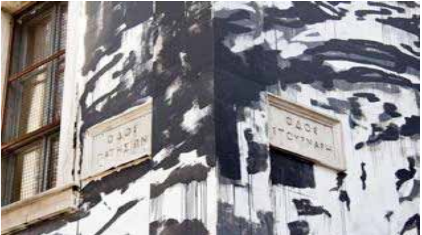
Figure 4 Artwork in Polytechneio. in March 2015,

As a result, reasonable questions arise through the prism of design about project preparation, implementation of a draft sketch (if it existed), organization of the time, execution methods, guidelines and requirements. The artwork in Polytechneio is described either as graffiti or as a mural. In an effort to clarify and relate these concepts, it is necessary to emphasize that both graffiti and mural art are processes governed by specific methodology and technical features,