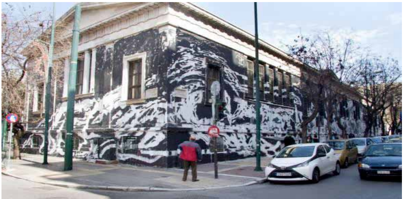
Figure 1 Artwork in Polytechnio. Photography George Fiorakis © in March 2015,

The structure of the paper is as follows. In section 2, we outline the socio-political background of Polytechnic School. On this basis, we argue that the building of Polytechnic School is regarded as a symbol of the Athens Polytechnic uprising against the Greek military dictatorship (1963-1974) due to its historical burden. Section 3 describes the method and empirical material from primary and secondary sources. In section 4 we analyze our case study, which leads us to the discussion in section 5, where we formulate some concluding considerations.