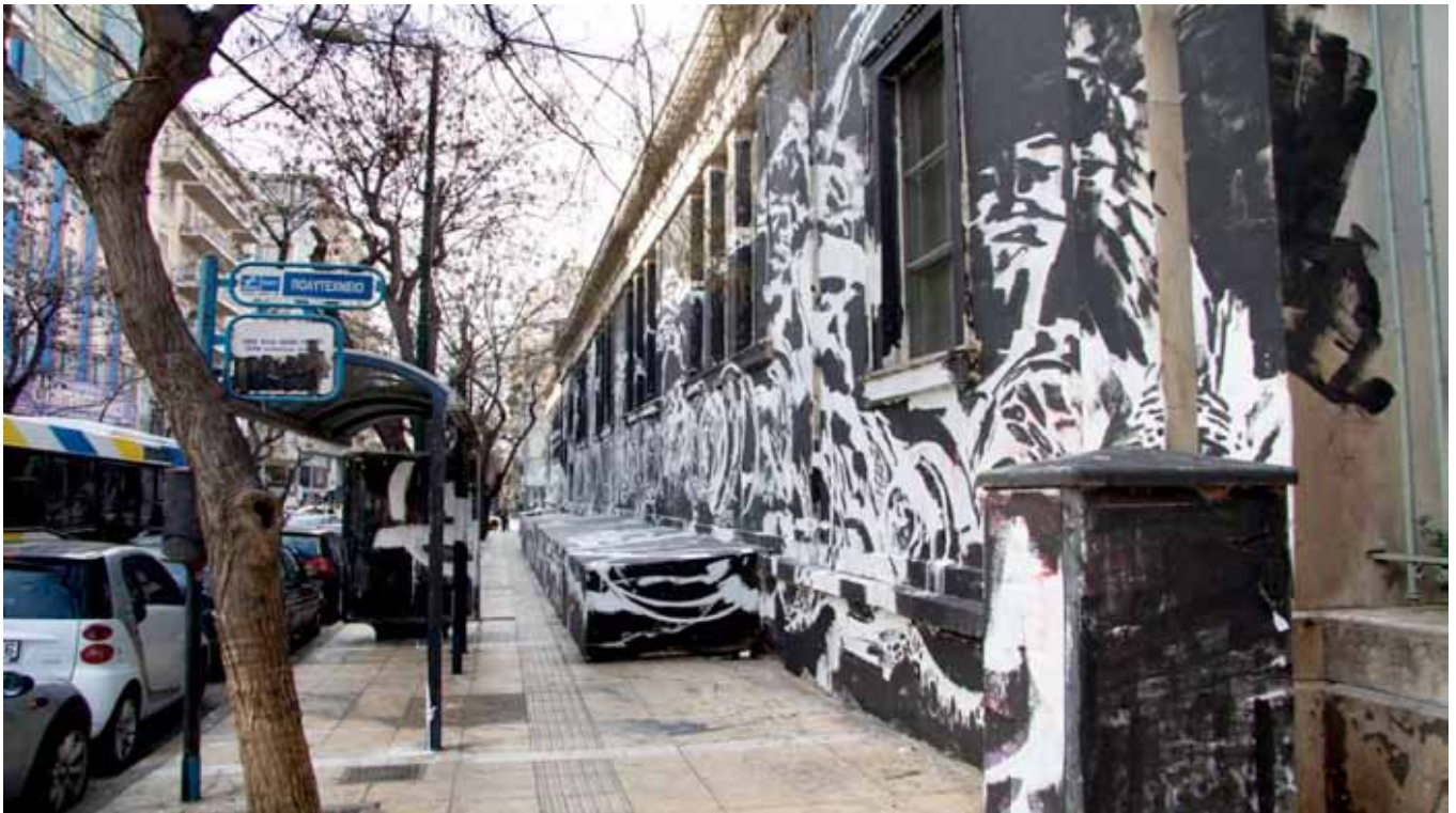
Figure 3 Artwork in Polytechneio. in March 2015