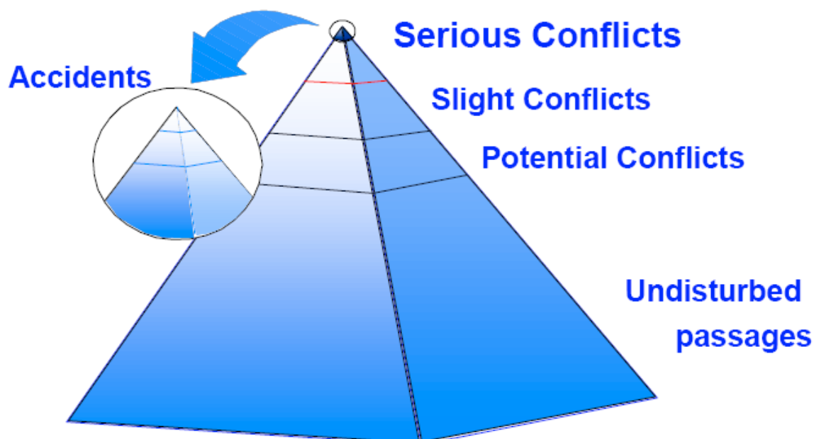
Figure 1: The safety pyramid (Hydén, 1987)

Conflicts are far more frequent than accidents, and therefore can potentially provide reliable information in situations where accident numbers are insufficient. An indication of the relative frequency of traffic events is shown in Figure 1. Undisturbed passages are those situations where there is no interaction between the various road users, an example being free-flow traffic.