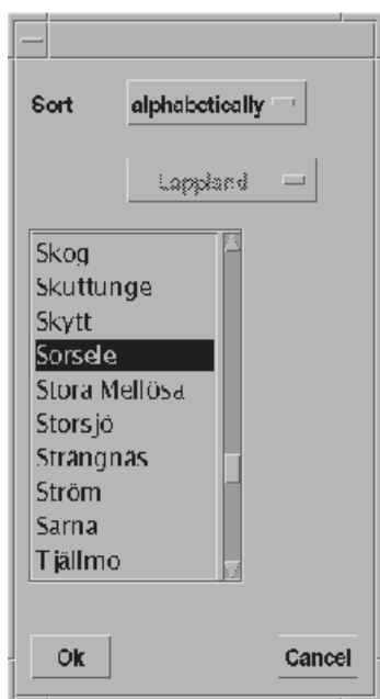
Figure 1. Example of Recording Location dialogue box.

Using the database, digitized phrases complying with any combination of these parameters can be extracted. A desired parameter combination is chosen by entering the appropriate information in a dialogue box. For example, a search may begin by identifying one of the recording locations available in the database. These locations are given either alphabetically or by province in the Recording Location dialogue box illustrated in figure 1 (in which 'Lappland' is the name of a Swedish province). For example, selecting 'Sorsole' as the interesting local dialect returns the Prosodic Parameter dialogue box shown in figure 2. From that box, selecting 'older', 'man', 'plain ( i.e. , simplex) word', '2 syllables', 'accent type 2' and 'focus' amounts to specifying the intersection between those parameters, i.e. , a phrase containing a bisyllabic accent 2 word [ti:u] 'ten' with focal accent as produced by an elderly gentleman of the Sorsole dialect.