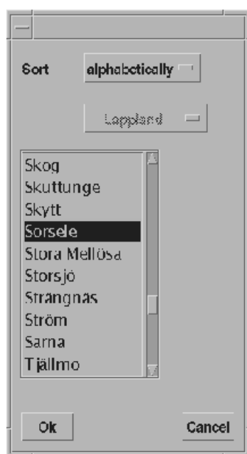
Figure 1. Example of Recording Location dialogue box.

Using the database, digitized phrases complying with any combination of these parameters can be extracted. A desired parameter combination is chosen by entering the appropriate information in a dialogue box. For example, a search may begin by identifying one of the recording locations available in the database. These locations are given either alphabetically or by province in the Recording Location dialogue box illustrated in figure 1 (in which 'Lappland' is the name of a Swedish province). For example, selecting 'Sorsole' as the interesting local dialect returns the Prosodic Parameter dialogue box shown in figure 2. From that box, selecting 'older', 'man', 'plain (i.e., simplex) word', '2 syllables', 'accent type 2' and 'focus' amounts to specifying the intersection between those parameters, i.e., a phrase containing a bisyllabic accent 2 word [ti:u] 'ten' with focal accent as produced by an elderly gentleman of the Sorsole dialect.