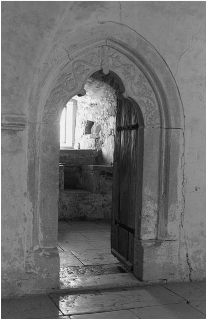
FIGURE 21.4 A late 13th-century doorway in the late 15th-century castle of Glimmingehus as an example of the reuse of history and the perpetuation of shared memory.

scale can be traced (Everson et al 1991) (Figure 21.5). The manorial complex in Rand was situated in the north-western part of the medieval village, north-west of the church. The central part of the residence consists of a moated site with access from the centre of the south side, facing the village. South of the moat are four small fishponds. North-east of the moated residence is a long bank with an additional long mound at its south end and protected by a double hedgerow, perhaps a former rabbit warren. A linear ditch, parallel with the nearby stream, may have been a mill leat. South of the church is a large, circular embanked site with stone foundations, perhaps the site of the dovecote. The earthworks of the village hint at a planned origin for the settlement, with regular plots lying on either side of a hollow way running east–west (Everson et al 1991, 153).