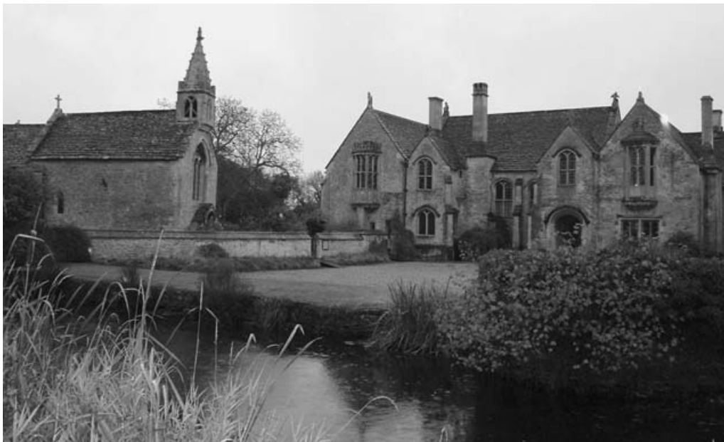
FIGURE 21.2 Great Chalfield Manor with the church located on the partly moated platform of the residence.

A striking feature when studying aristocratic residences throughout Europe is the close spatial relationship between residence and church (Figure 21.2). There are many examples where the parish church is actually located in the courtyard of a residence. A religious dimension is almost always present in the spatial concept of the aristocracy. If a church is lacking from the vicinity of a residence, a minor chapel is often incorporated in the residence itself. Similar arrangements existed in almost all