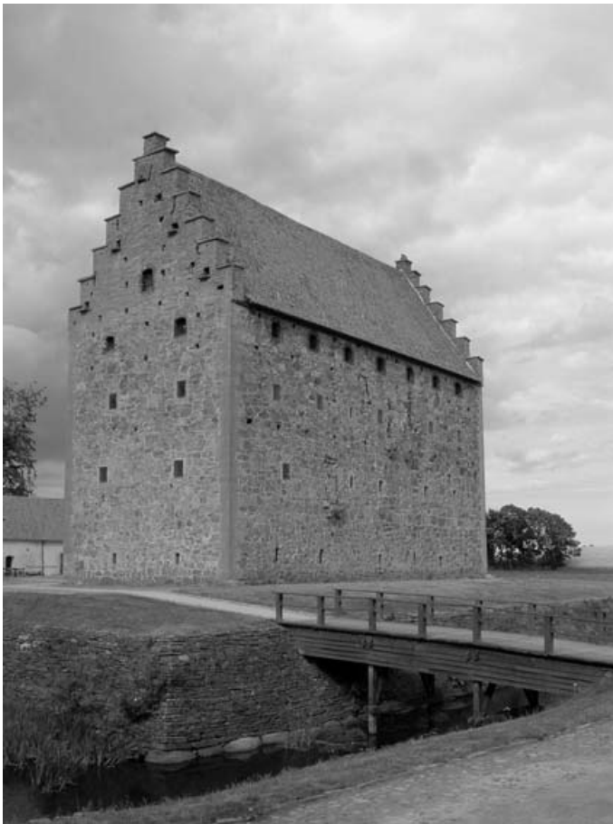
FIGURE 21.3 Glimmingehus in Scania as it appears today.

Glimmingehus is one example where several of the themes above can be found in both architecture and landscape (Figure 21.3). The castle was built by the knight Jens Holgersen Ulfstand, Lord High Admiral of Denmark and Provincial Governor of Gotland, a member of the higher aristocracy in Denmark (Ödman 1996; 1999; 2004). According to the inscription on a stone tablet over the entrance to the castle, Jens Holgersen laid the foundation stone to the castle in 1499. The castle replaced an earlier stone house that was demolished before the present house was built. It is a typical medieval castle on a platform demarcated by a moat, in a secluded position compared to the location of the medieval villages in the vicinity. The main building is a four-storey, rectangular stone building with thick walls with loopholes and tiny windows. The entrance and the internal staircase in the house are filled with defensive surprises for an intruding enemy, making it possible for the defenders to attack them at every floor level. Glimmingehus thus resembles a keep, where the defenders