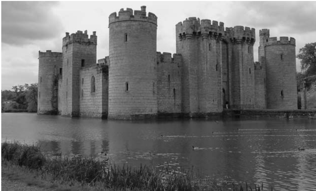
FIGURE 21.1 Bodiam Castle, Sir Edward Dallyngrigge's late 14th-century castle is an excellent example of an individual putting his stamp on the landscape. It is also a castle in the centre of a scholarly debate.

So far the discussion of medieval designed landscapes has mainly been a concern of English scholars, but there can be no doubt that the same type of landscapes also existed in other parts of Europe. A study by Anders Andrén has shown the presence of deer parks in medieval Denmark and that this phenomenon was probably much