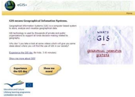
FIGURE 2 THE CLOUD, INTRODUCTION WHAT IS GIS? [3-5].

As can be seen in the portal, there are options for simple explanations of GIS, e.g. from YouTube or, if the interest increases (e.g. videos from Lund University) that explains in more detail about GIS, (Figure 2, 3). This corresponds to personalization [8, 11, 18, 19] and Laurillard concepts [18], using different approaches depending on learning styles for individuals. Additional links in the cloud “What is GIS?” are to be found as below [3-5].