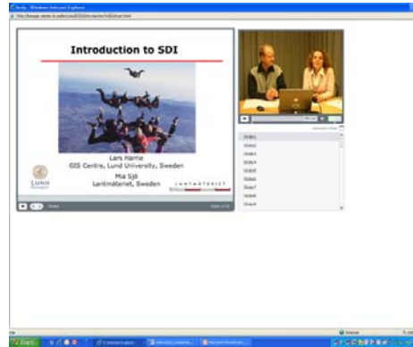
FIGURE 5. FROM THE CLOUD GIS EDUCATION. THE SDI MODULE, 3ECTS [3-5].

In addition one example is from the Education cloud (Figure 5). Courses and education related to GIS are available here. In the eGIS+ Project four courses with credits were developed: GIS Introduction 3 ECTS, Open Source Geospatial 3 ECTS, Introduction to SDI 3 ECTS, and GIS Introduction 10 ECTS. All partner institutions offering GIS courses and a set of video lectures (Figure 6) has been produced within the partnership available through the portal www.e-gis.org .