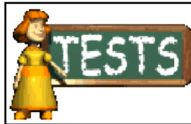
FIGURE 4 TEST YOURSELF GAMES WHERE USERS WILL GET A GRADING AS IN TRAVELLING THE WORLD [3-5].

From the same navigation cloud “What is GIS?” there are information and navigation with links for further learning possibilities depending interest, needs and level of complexity, such as: GIS in two hours, Introduction to GIS in 18 minutes, etc. GIS in two hours; Introduction to GIS in 18 min; Map Projections and Coordinate Systems; Databases – introduction; Geo-spatial Information technology in China; Geodetic and cartographic Control Information System; “Google Earth viewing you”; “Test Yourself” (Figure 4), Here, users will get an impression of how good they are “to do GIS” www.e-gis.org . Different games [36] that are already available on the Internet are provided here as re-usable learning objects [23, 24].