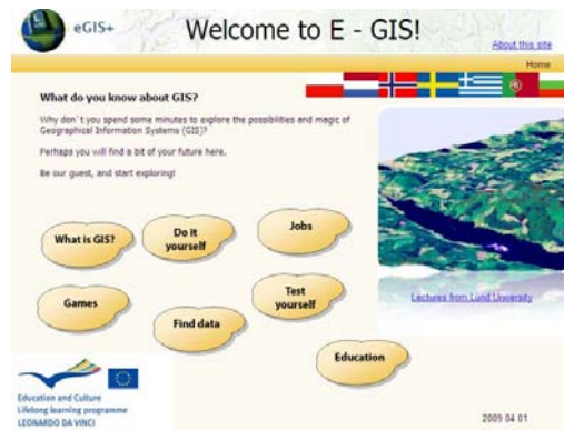
FIGURE 1 OVERVIEW OF THE eGIS+ PORTAL www.e-gis.org

The purpose of using “navigation clouds” is to let users find their own area of interest, and to navigate and “jump” depending on personal or professional interests, needs and curiosity. For example, under the “What is GIS?” cloud, short descriptive videos at different levels depending on the users pre-understanding will be found (Figure 1). In “Do it yourself” there are possibilities and information on what kind of software and web applications can be used, as well as examples on how to make a Google map and different kinds of exercises [3-5].