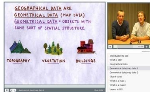
FIGURE 3 VIDEO FROM LUND UNIVERSITY ALSO IN THE CLOUD WHAT IS GIS? [3-5].

From the same navigation cloud “What is GIS?” there are information and navigation with links for further learning possibilities depending interest, needs and level of complexity, such as: GIS in two hours, Introduction to GIS in 18 minutes, etc. GIS in two hours; Introduction to GIS in 18 min; Map Projections and Coordinate Systems; Databases – introduction; Geo-spatial Information technology in China; Geodetic and cartographic Control Information System; “Google Earth viewing you”; “Test Yourself” (Figure 4), Here, users will get an impression of how good they are “to do GIS” www.e-gis.org . Different games [36] that are already available on the Internet are provided here as re-usable learning objects [23, 24].