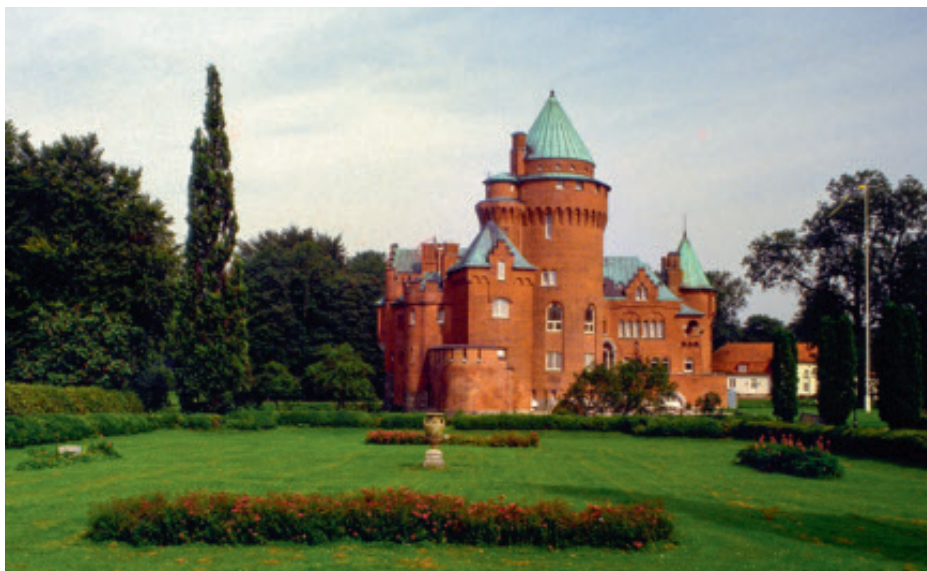
Fig 9.2 Romantic Hjularöd castle in Scania, Sweden, built 1894–97.

The medieval dream is also visualized in exhibitions at the Historical Museum at Lund University, which dates back to 1805. The main focus here, when it comes to the Middle Ages, is on churches and their fittings.