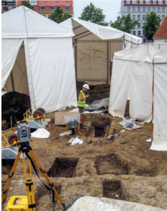
Excavations at Assistens cemetery in Copenhagen, Denmark.