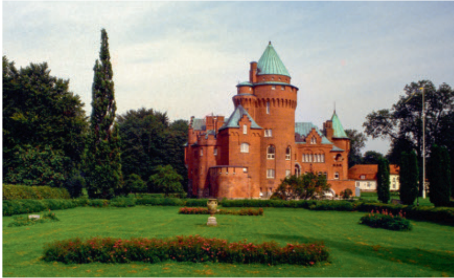
Fig 9.2 Romantic Hjularöd castle in Scania, Sweden, built 1894–97.

The medieval dream is also visualized in exhibitions at the Historical Museum at Lund University, which dates back to 1805. The main focus here, when it comes to the Middle Ages, is on churches and their fittings.