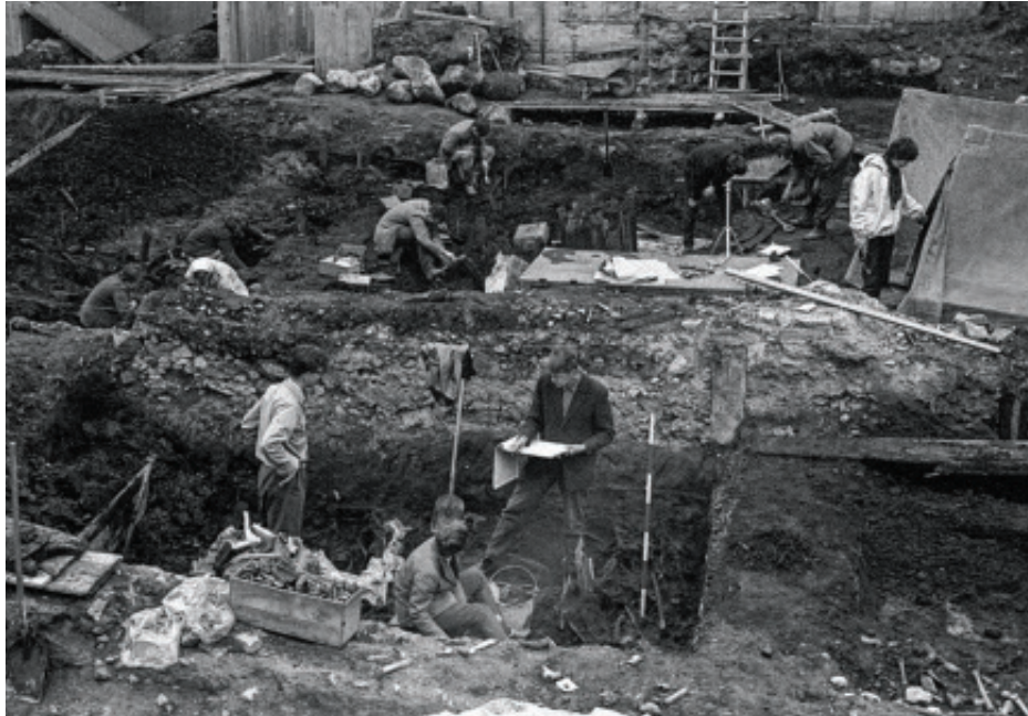
Fig 9.3 The 'Thule Excavation' in Lund, Sweden. Photo: Ragnar Blomqvist, The Museum of Cultural History in Lund , 1961.

There are, however, both professional and personal connections between the two roots of Medieval Archaeology. Thus the city's antiquary at the Museum of Cultural History, who for decades conducted investigations into the cultural layers of medieval Lund, had in his luggage an art-historical dissertation on churches (Blomqvist 1929).