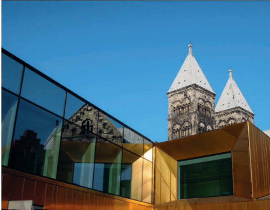
Fig 9.1 Lund Cathedral from the Middle Ages and the modern Visitor's Centre opened in 2011.

the 1980s and 90s; (4) the formal transition to Historical Archaeology in 2005; (5) an Archaeology of Modernity; and, finally (6), comments on the character of the new discipline.