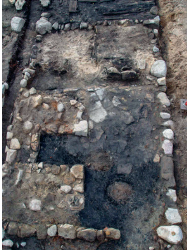
Fig 9.6 Smithy for the manufacture of pistols uncovered in the urban excavations in Jönköping, Sweden. Photo: Claes Pettersson, Jönköping County Museum, 2004.

materialitet (The Materiality of Modernity; see Lihhammer & Nordin 2010; also Lihhammer 2011), where many of the articles focus on the so-called Early Modern Period. Behind the Archaeology of Modernity stand a number of archaeologists mainly connected to the National Heritage Board and the National Historical Museum in Stockholm.