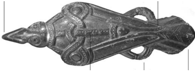
FIGURE 1. Species of bird – raven or bird of prey? Bird brooch U 560 from Uppåkra, Skåne, Sweden. Length: 58 mm.

when an amateur sets off into the world of birds, to find out about the descriptions and habitats of different species, it has clear travel associations. The raven has a relatively long and curved bill, long pointed wings with obvious separation of primaries while soaring, and a long graduated or wedge-shaped tail. Falcons and hawks are broad-chested, and have a heavy curved bill, long, broad, pointed wings, and heavy feet with sturdy claws, and long tail which can be rounded, straight and wedge-shaped.