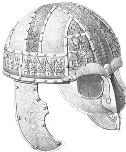
FIGURE 2. The helmet from the boat grave Vendel XIV, Uppland, Sweden, reconstructed by Olof Sörling (Stolpe and Arne 1912, Pl. XLI).

Both ravens and different species of birds of prey change body position and feathers depending on what they actually do. Thus, the examination of bird brooches to identify species is an ambiguous job. Looking through all the bird