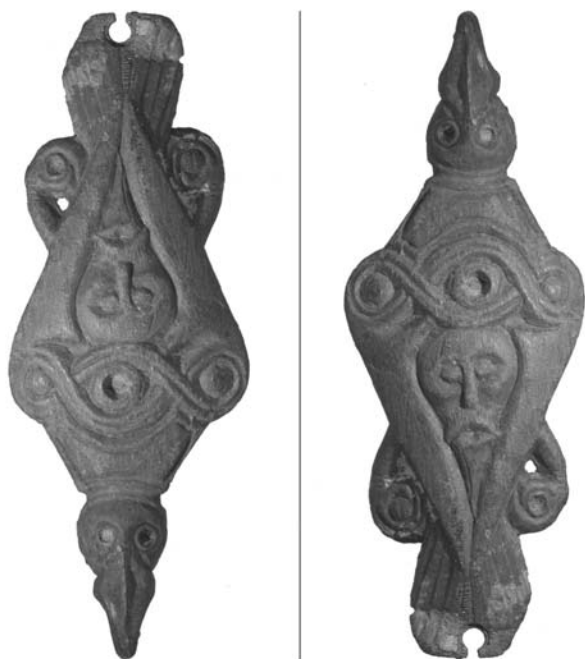
FIGURE 4. Whose identity? Two perspectives on bird brooch U 263 from Uppåkra, Skåne, Sweden. Length: 55 mm.

To sum up, the association between bird brooches and birds of prey, and a male face to female jewellery makes the wearer and the male person quite interesting. Whose is the prey? The bird brooches and the connotations of falconry