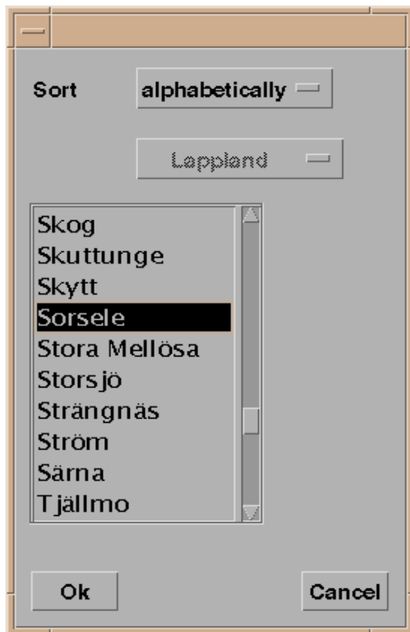
Figure 1. Example of Recording Location dialog box.

results; the phrases complying with these specifications can either be played back by the user, or they can be sent to a new file. Thus, clicking 'Create Sound File' will result in a file containing all instances of the selected phrases. The contents of