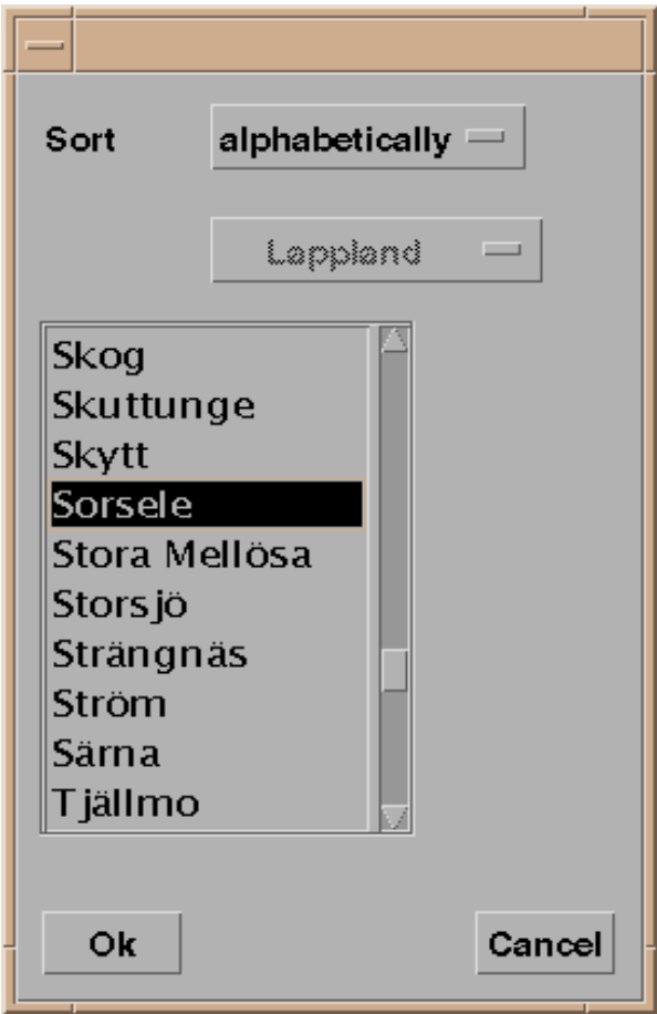
Figure 1. Example of Recording Location dialog box.

results; the phrases complying with these specifications can either be played back by the user, or they can be sent to a new file. Thus, clicking ‘Create Sound File’ will result in a file containing all instances of the selected phrases. The contents of