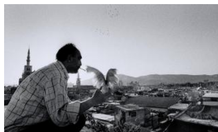
PHOTOS: My memories of the Kashash al Hamam of Syria