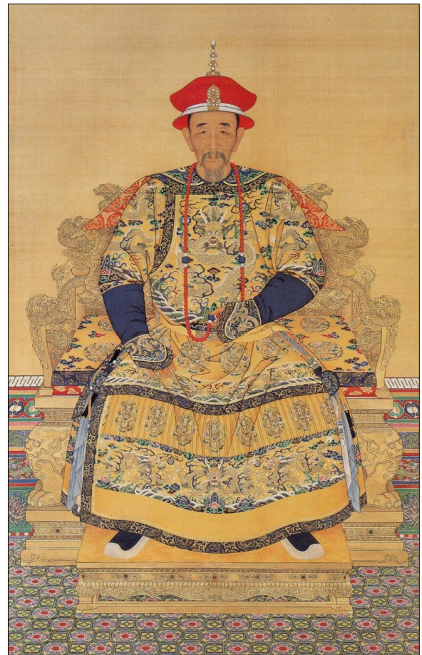
Figure 1: The Kangxi Emperor (en.wikipedia.org).

As an example where the Sun's altitude was used, we can use one of the observations made by Father Noël to determine the longitude of Hoai-ngan (Huai'an) in China on 14 September 1689 ( Mémoires , 1729: 779). The geographical latitude was 33^\circ 34' 40'' . The clock time was 1 hour 50 minutes after noon and the corrected altitude of the Sun was then 52^\circ 47' 4'' . The declination of the Sun was 3^\circ 11' north. Using the formula above we compute the true local solar time as 1 hour 31 minutes 58 seconds, thus the clock was 18 minutes 2 seconds fast.