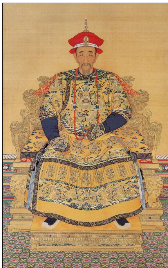
Figure 1: The Kangxi Emperor.

As an example where the Sun's altitude was used, we can use one of the observations made by Father Noël to determine the longitude of Hoai-ngan (Huai'an) in China on 14 September 1689 ( Mémoires , 1729: 779). The geographical latitude was 33^\circ 34' 40'' . The clock time was 1 hour 50 minutes after noon and the corrected altitude of the Sun was then 52^\circ 47' 4'' . The declination of the Sun was 3^\circ 11' north. Using the formula above we compute the true local solar time as 1 hour 31 minutes 58 seconds, thus the clock was 18 minutes 2 seconds fast.