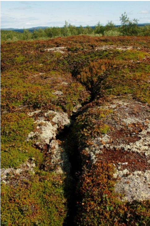
Figure 2a. Example of dry hummock vegetation on top of a 2 m high palsa, where large cracks have beginning to form in the dry peat layer.

that may further amplify the warming. The strength of this positive feedback effect (positive in the sense that it reinforces the already ongoing climate change) depends on how much carbon that is released, in which form it is released (since CH 4 is an over 20 times more potent greenhouse gas than CO 2 on a 100 year's timeframe (Solomon et al. 2007)) and at what rate the vegetation can offset this release of greenhouse gases by assimilating carbon through photosynthesis. The projections of the future distribution of dry and moist hummock permafrost mires show that the higher carbon uptake in moist hummock permafrost mires is offset by the increased release of methane in the wetter environment, and an overall positive radiative forcing effect (the additional warming effect the release of greenhouse gases have on the climate).