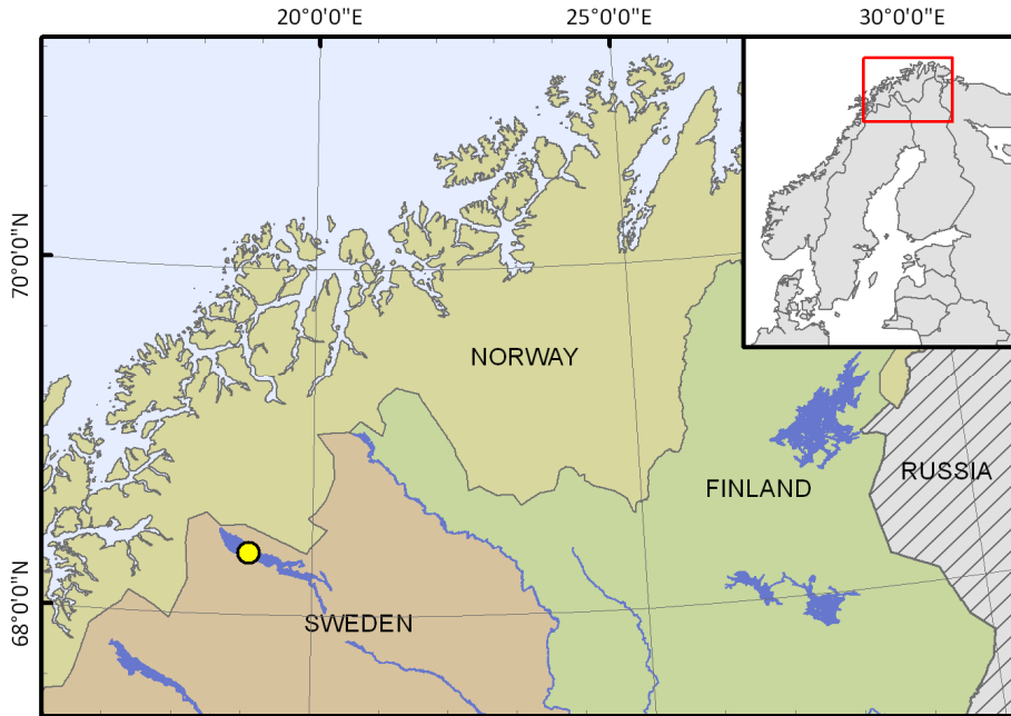
Figure 1. Overview of subarctic Fennoscandia, the focus region of this work. The yellow dot indicates the location of Abisko and Storflaket mire.