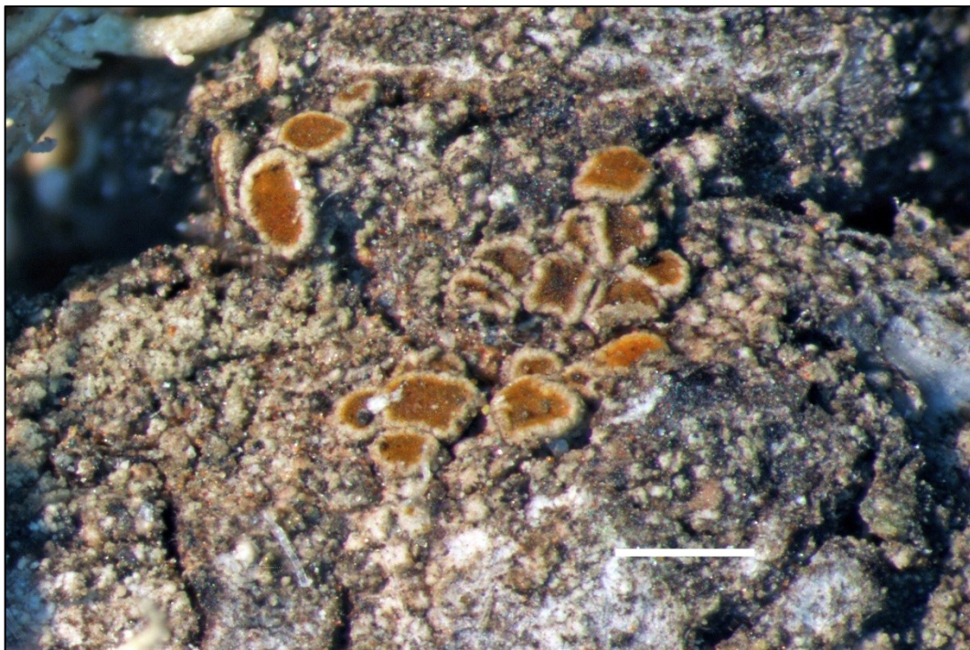
Figure 3. Caloplaca marchantiorum . Holotype. Scale: 500 \mu m.

Caloplaca marchantiorum : Australia. New South Wales : North Western Slopes, between Delungra and Warialda, along the Gwydir Highway, Eucalyptus woodland, on bark, 2004-01-17, S. Kondratyuk 20458 (CANB, holotype) (fig. 3).