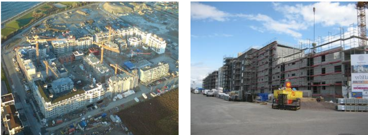
Fig. 2. Urban developments in Malmö, Sweden.

The working approach for the Urban Transitions Öresund project is the analysis of case studies – including existing and planned buildings and districts in the Öresund Region – from which essential lessons are being extracted and subsequently tested on further projects in order to obtain general lessons (see Fig. 2). Importantly, the case studies from the Öresund Region are being supplemented by research on international experiences with a focus on Europe. The workflow for the case studies will use cooperation and implementation methods, which provide both the framework for the process and are simultaneously developed in the process. The total learning achieved will form the basis for developing models and tools for collaboration on sustainable urban transformation.