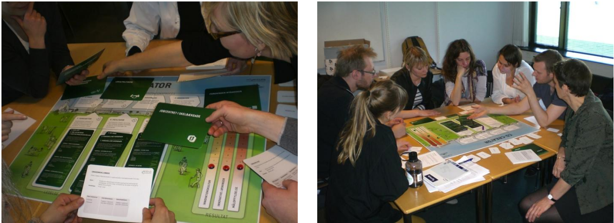
Fig. 4. Gaming sessions to inspire creative thinking in Copenhagen, Denmark