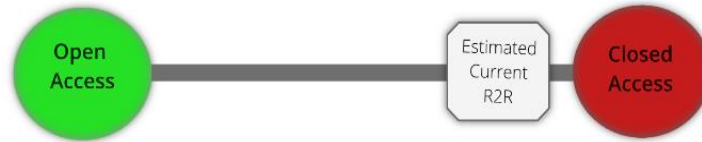
Figure 2. The Span of R2R