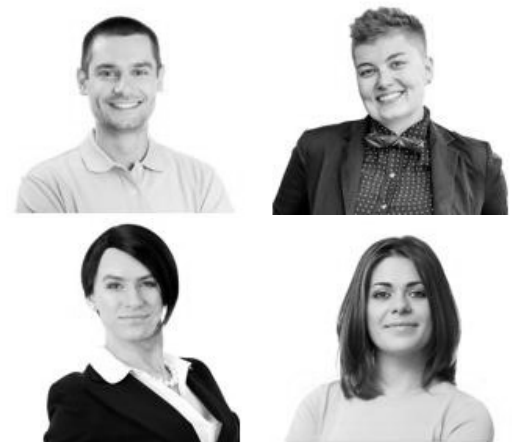
Figure 1. Subset of pictures measuring perceived diversity for normative and non-normative gender expression. "From what you have read about the organisation, which two people do you believe work within the organisation?"