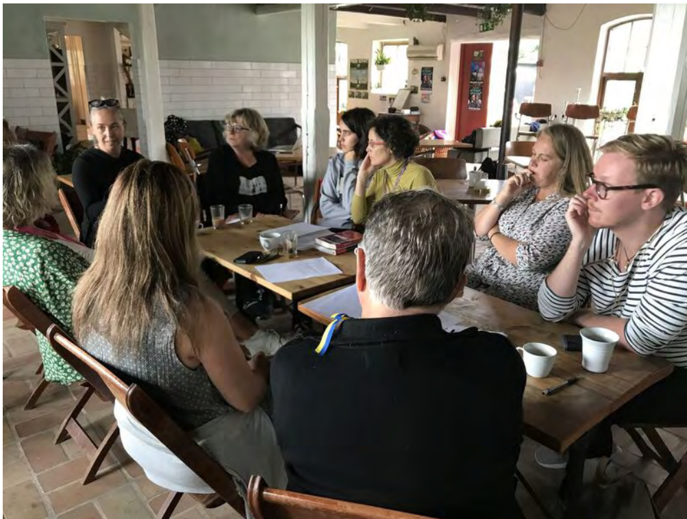
Seminar II - Group 1: Institution table

There was a general discussion about this festival – and the theatre in general – being a potential "Trans Zone", where different ideas and multiple identities could and should be explored and negotiated on equal terms. Distinctions were made between archetypes – that we all carry within – and stereotypes, which are images formed within specific cultural contexts.