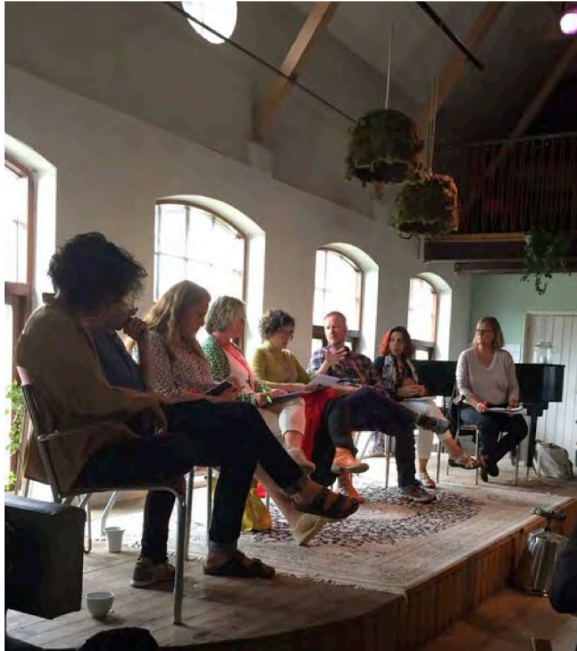
Panel from 2 nd day: Seminar II