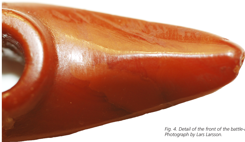
Fig. 4. Detail of the front of the battle-axe.

The Battle-Axe Culture is well represented on the island of Öland by graves and loose finds. As everywhere, settlement sites are indicated by pottery finds. Battle-axes have been found in the neighbourhood of the amber find, and there are even pieces cor-