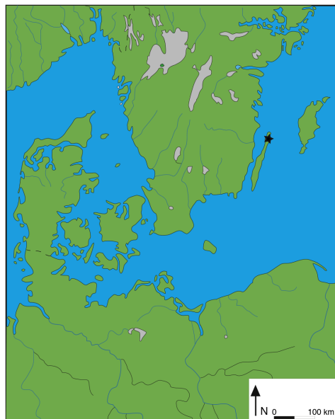
Fig. 1. The find location, on the island of Öland, of the battle-axe in amber. Drawing by Lars Larsson.

The battle-axe is 4.4 cm long and 1.4 cm wide (Fig. 2–3). It is shaped with the in-