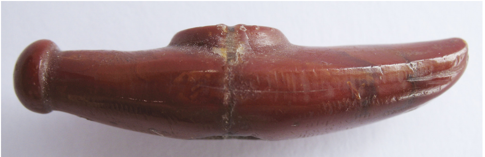
Fig. 3. The battle-axe from the side. Note the ring around the shaft-hole and the keel-shaped edge.

Another mysterious circumstance is the find location, situated about 10 m a.s.l. The site must have been below sea level dur-