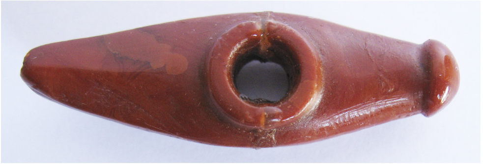
Fig. 2. The battle-axe from above.

tention of distinguishing all the elements of a battle-axe of the period, including a distinct ring around the shaft-hole on the upper side and a pronounced cone at the neck. Unlike ordinary battle-axes, it has a rounded, keel-shaped edge.