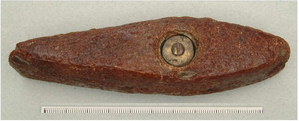
Fig. 7. A battle-axe probably dated to the Late Neolithic from Instön, western Sweden.

of the burials were those of boys. Double-edged stone axes are dated to the early Middle Neolithic (Ebbesen 1975). However, most of the amber miniatures seem to date to an earlier part of the same period.