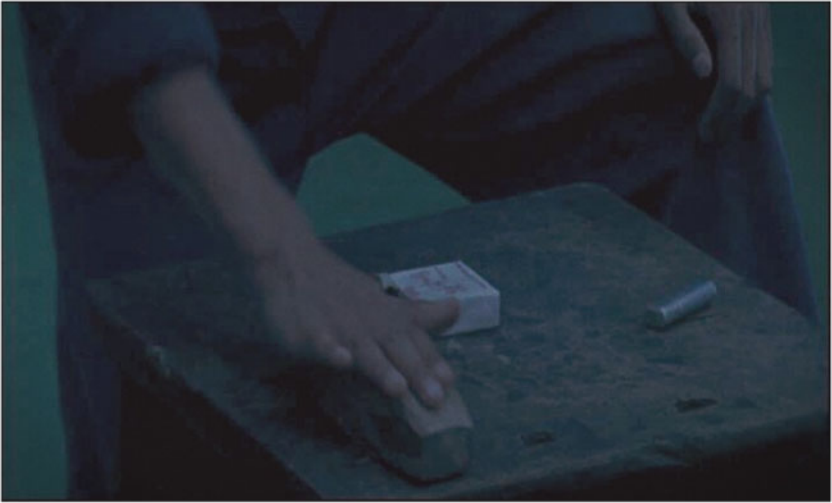
Figure 2. Luo's storytelling stage props

the novel. 32 In the novel, when Luo and Ma take the Petite Tailleuse to the screening of the North Korean film, the story of which she has already heard Luo and Ma recount, the Petite Tailleuse tells Ma: 'C'est beaucoup plus intéressant, quand c'est toi qui le racontes' ('It's so much better when it's you telling the story') (p. 104; p. 77), without suggesting any reason. However, this scene in the Chinese version of the