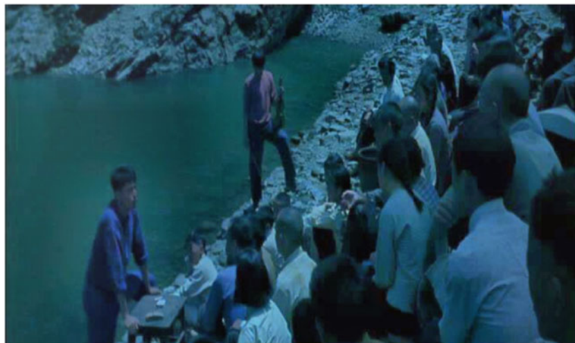
Figure 3. The storytelling performance arena