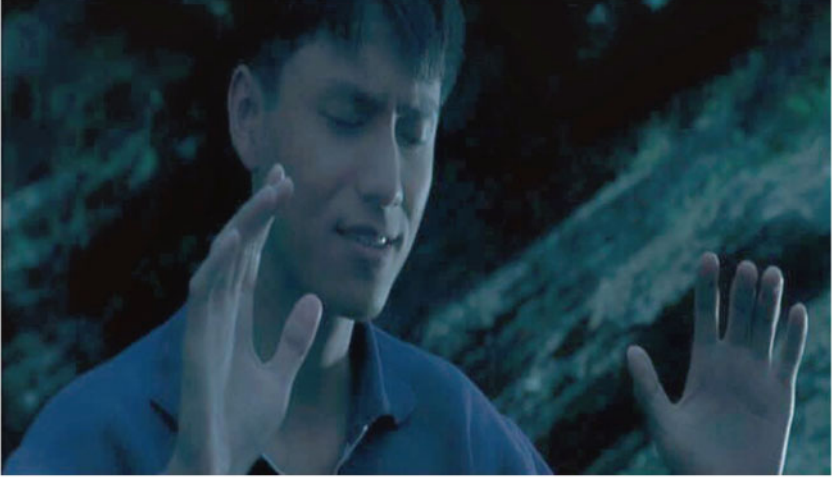
Figure 1. Luo's performative storytelling