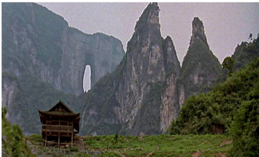
Figure 6. The iconic Tianmen Mountain in Hunan in the background