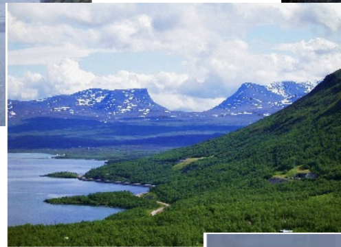
Sarek National Park