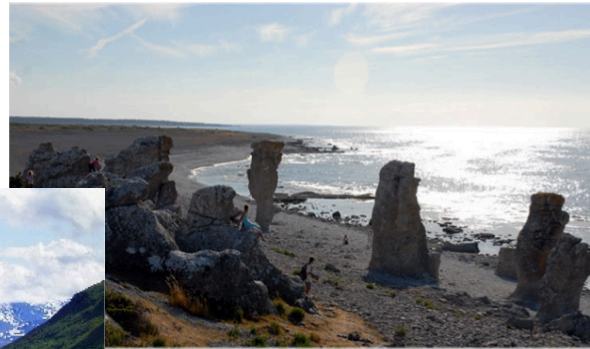
Raukar on Gotland