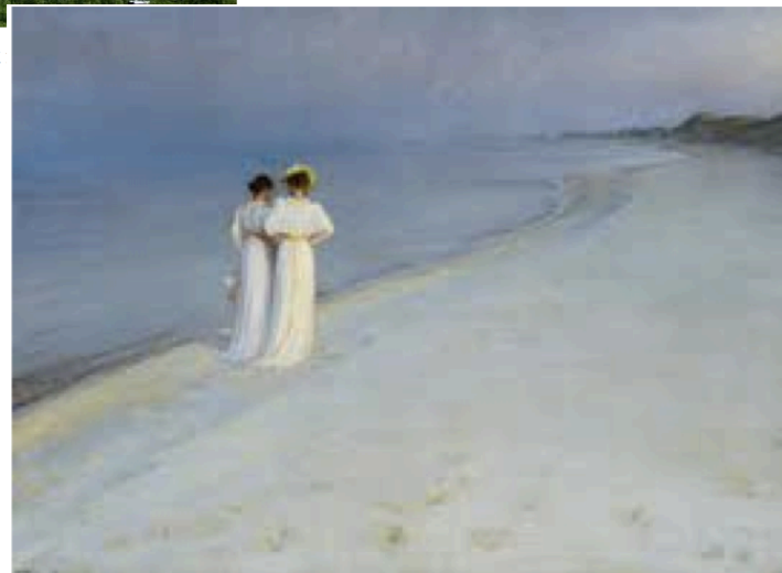
Sommerabend, Peder Sverin Krøyer (Skagen)