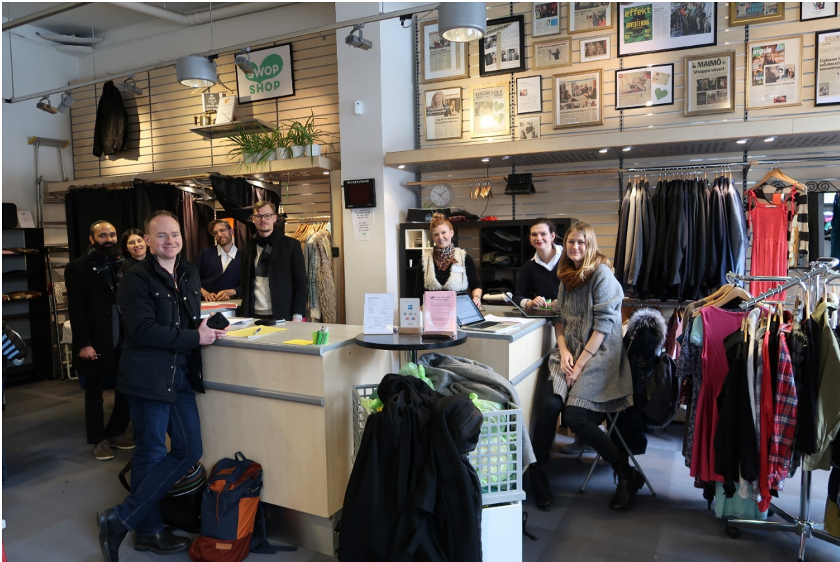
Figure 1. Mobile lab on Sharing in Malmö – visit to Swop Shop