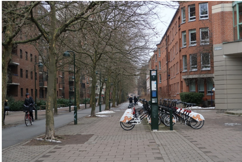
Figure 13. Municipal bike sharing scheme Malmö by Bike

Municipal bike sharing helps deliver health and environmental benefits by promoting active travel by bike instead of using a car (Fig. 13). In particular, it targets short trips with the hope of reducing overall traffic and the use of parking space. The initiatives contribute to the environmental sustainability agenda in the city, and could improve the well-being and health of Malmö citizens.