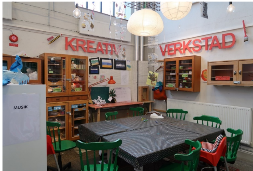
Figure 14. Creative workshop at Garaget library