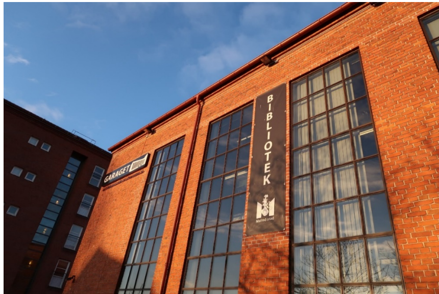
Figure 9. Garaget – a library for books and things

high share of immigrant population, low employment rates, low wages, and high crime levels). They also give their users the opportunity to volunteer, e.g. there are English and Arabic language cafes led by Garaget users on a voluntary basis. Garaget works with children to educate them on leisure time activities.