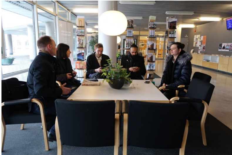
Figure 6. Mobile lab team at Malmö City Hall (Stadshuset)

different kinds of bikes, including cargo and family bikes. This solution has allowed the developers to avoid building extra car parks – a trend that is becoming increasingly popular in Malmö.