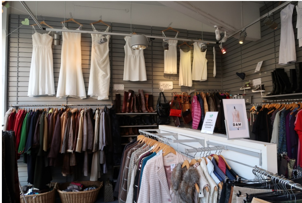
Figure 5. Swop Shop – a female clothes selection