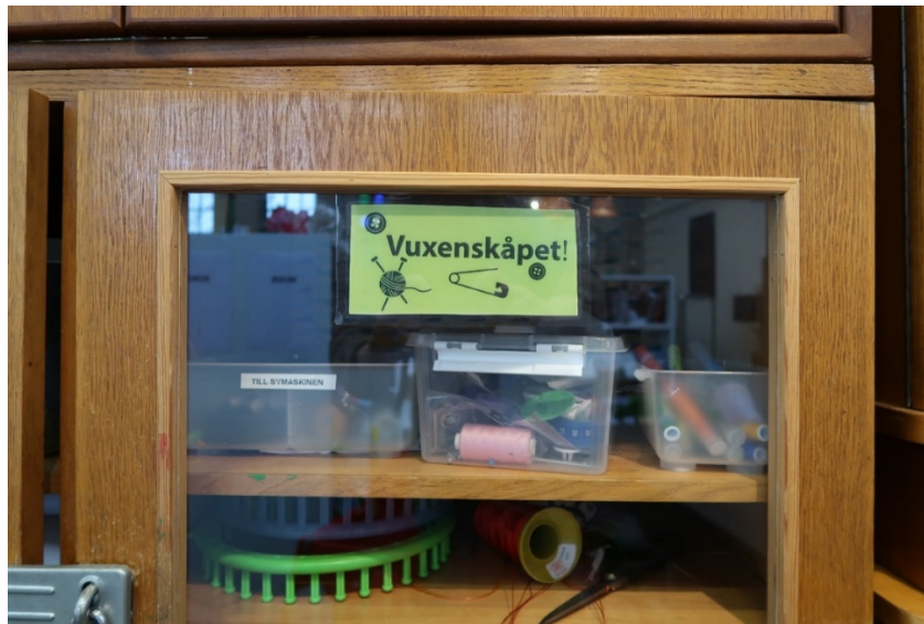
Figure 12. Accessories for sewing at Garaget in Malmö