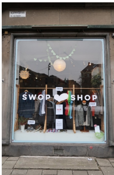
Figure 4. Swop Shop – a clothes swapping boutique in Malmö

According to the Swop Shop manager, attracting and maintaining customers is a challenge, as swapping is associated with a certain type of behaviour – "one has to be a swapper". Swapping requires time and attention, as it is very rare that a customer comes to the Swop Shop and finds a garment in the precise style and size, and "just what they want". The manager is optimistic about the future of swapping as, potentially, any consumer item can be swapped. However, she, thinks that "it will be at least five years more before this becomes common, if it doesn't speed up the municipality nudging people", so identifying the role of the City of Malmö in the sharing economy as important.