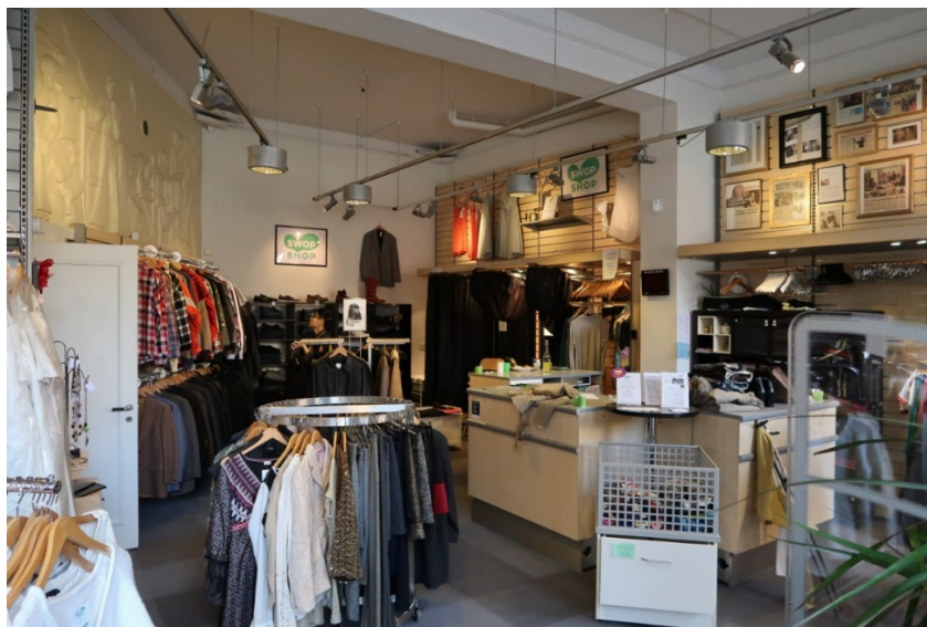
Figure 11. Swop Shop in Malmö

The motivations for establishing Swop Shop (Fig. 11) were based on personal experiences of the owner with buying, owning and sharing clothes. In particular, accumulation of dozens of kilograms of clothes in her own wardrobe stimulated the Swop Shop owner to explore new ways of consuming. The owner of the shop said that much had been learned while the shop was developing, its points system for swapping, and the ways to establish an alternative way of exchanging clothes.