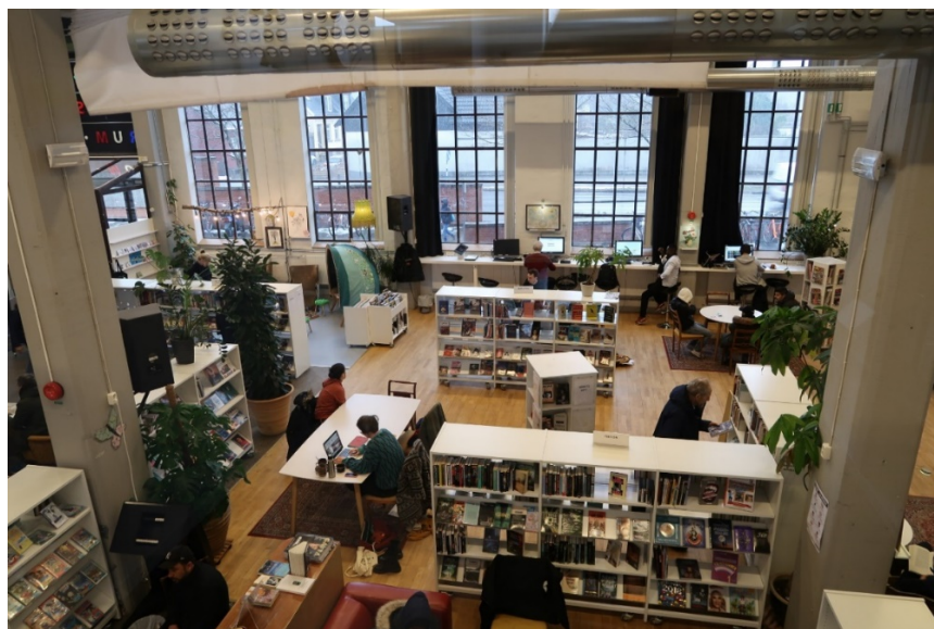
Figure 10. Inside Garaget library