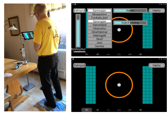
Figure 2: The final ActiveFOAM setup.

Both the pressure sensitivity, and how sensitive the interactive foam pad is to changes in balance can be adjusted. The volume of the sounds is controlled via a slider on the screen (figure 2, right). ActiveFoam is connected to feedback lamps that can display the progress (see below) via the local server. This server can be used to set a daily goal for balance training, e.g. 10 or 20 minutes per day. Training can be divided into several sessions per day. To count a use session, ActivFOAM registers when someone steps on and off the balance pad.