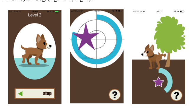
Figure 4: Three screens from the game.

left). The app has two different graphical themes, stars (figure 4, middle) or dog (figure 4, right).