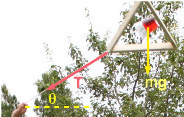
Figure 3. During a sufficiently fast rotation the surface of the liquid remains parallel to the bottom of the glass, orthogonal to the string

For an angle close to 30^\circ , as in the photo, the glass is lower by \Delta H = L/2 . This implies an increased speed and the centripetal acceleration will be larger by 2g\Delta H/L , giving, a_c = g + 2g\Delta H/L = 2g . The radial component of the the force of gravity can only provide an acceleration g \sin \theta \approx g/2 . The tension in the string in the photo must thus be at least 3mg/2 , to provide the required centripetal force. A faster rotation implies a larger centripetal force, and a larger tension in the string, while leaving the tangential components of force and acceleration unaffected.