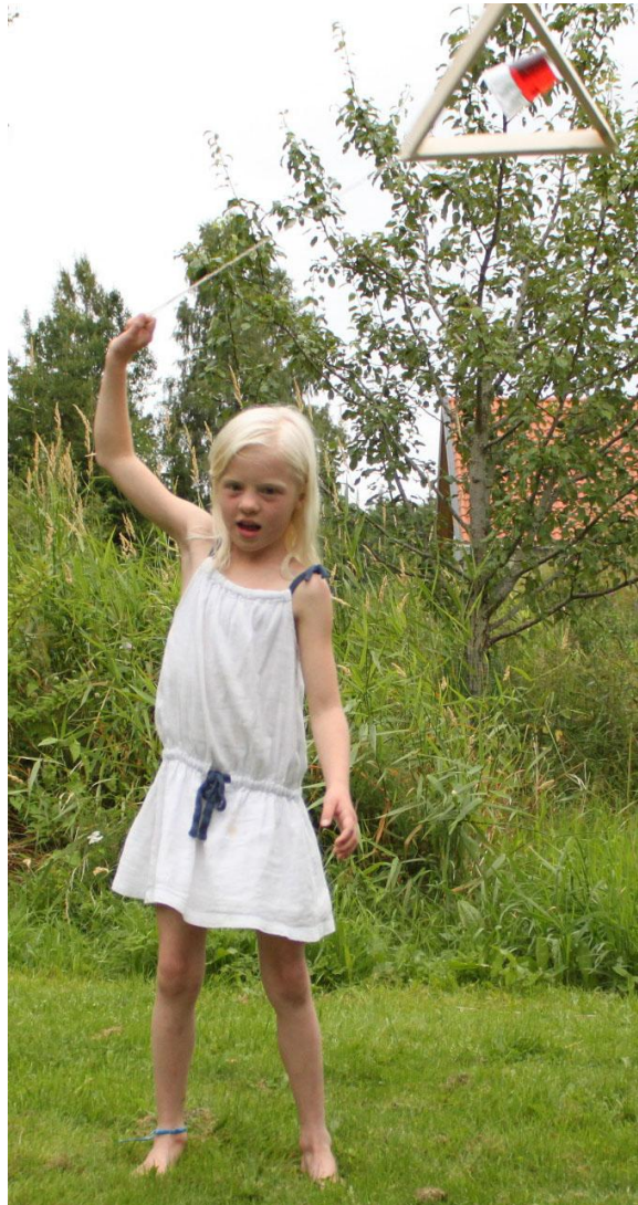
Figure 2. During rotation - and other motions - the surface of the liquid remains parallel to the bottom of the glass, orthogonal to the string

Have you ever swung a bucket full of water over your head, and marvelled about not getting wet. Most likely, you heard explanations from adults mentioning the "centrifugal force" as responsible for "pushing the water" away from the centre of the circle. Still, your physics textbook is more likely to insist that the centrifugal force does not exist. The water in the bucket is then instead described as accelerating towards the ground with an acceleration larger than the acceleration of gravity, g . The photo in Figure 1