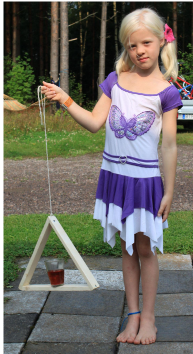
Figure 1. A glass of cordial, resting on wooden triangle on a string