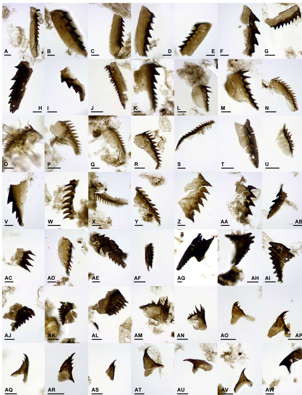
Fig. 3. Photomicrographs of selected representative scolecodonts recorded from Kinnekulle, Västergötland, southern Sweden. Scalebar 20 \mu m. A–I. Placognath jaws tentatively assigned to mochtyellids, specimens probably represent first maxillae. A. LO 12339t-a, HÄ12-9. B. LO 12340t-a (possible xanioprionid), TH12-LHP. C. LO 12339t-b, HÄ12-9. D. LO 12341t-a, HÄ12-9. E. LO 12341t-b, HÄ12-9. F. LO 12342t-a, HÄ07-7. G. LO 12343t-a, HÄ07-7. H. LO 12344t-a, HÄ07-4. I. LO 12341t-c, HÄ12-9. J. First maxilla(?), ctenognath?, LO 12342t-b, HÄ07-7. K–M. Possible ctenognath (tetraprionid) right maxillae; K. LO 12345t-a, HÄ07-1. L. LO 12343t-b, HÄ07-7. M. LO 12346t-a, HÄ07-1. N–S. First maxillae (some might represent basal/laeobasal ridges). Mochtyellid, tetraprionid and/or Lunoprionella -like jaws. N. LO 12341t-d, HÄ12-9. O. LO 12341t-e, HÄ12-9. P. LO 12346t-b, HÄ07-1. Q. LO 12345t-b, HÄ07-1. R. LO 12343t-c, HÄ07-7. S. LO 12344t-b, HÄ07-4. T–AD. Unidentified scolecodonts of probable placognath/ctenognath affinity. T. LO 12344t-c, HÄ07-4. U. LO 12344t-d, HÄ07-4. V. LO 12340t-b, TH12-LHP. W. LO 12347t-a, TH12-LHP. X. LO 12341t-f, HÄ12-9. Y. LO 12341t-g, HÄ12-9. Z. LO 12345t-c, HÄ07-1. AA. LO 12339t-c, HÄ12-9.