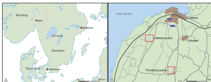
Fig. 1. A. Map of southern Sweden and its geographic surroundings showing the location of Mount Kinnekulle. B. Detail map of northern Kinnekulle with the location of the Hällekis and Thorsberg quarries (modified from Lindskog 2014).