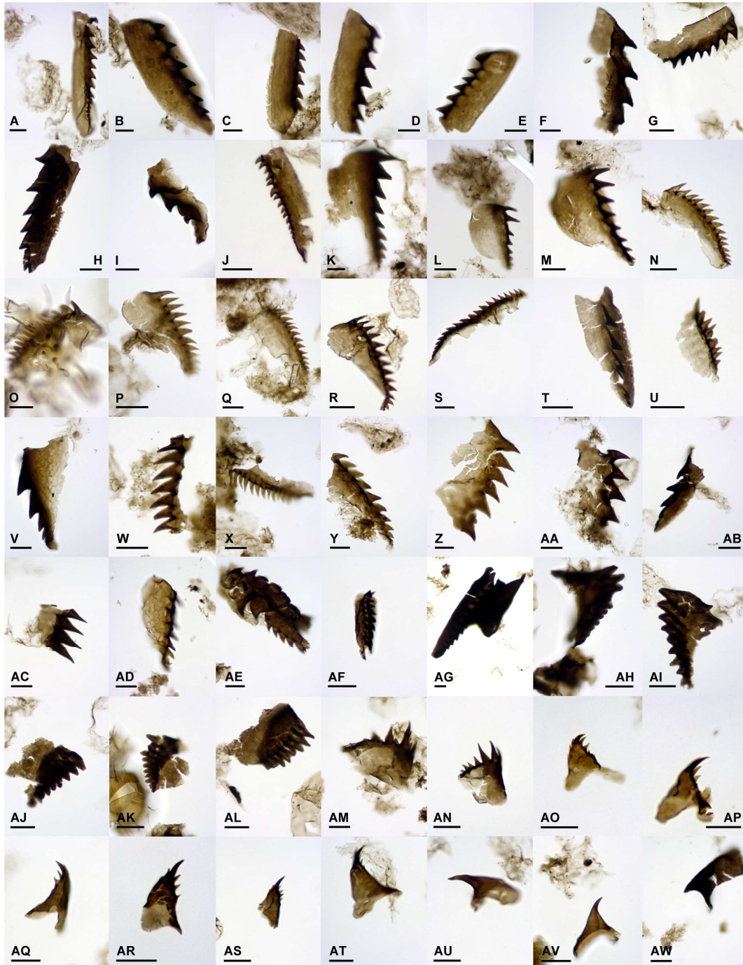
Fig. 3. Photomicrographs of selected representative scolecodonts recorded from Kinnekulle, Västergötland, southern Sweden. Scalebar 20 \mu m. A–I. Placognath jaws tentatively assigned to mochtyellids, specimens probably represent first maxillae. A. LO 12339t-a, HÄ12-9. B. LO 12340t-a (possible xanioprionid), TH12-LHP. C. LO 12339t-b, HÄ12-9. D. LO 12341t-a, HÄ12-9. E. LO 12341t-b, HÄ12-9. F. LO 12342t-a, HÄ07-7. G. LO 12343t-a, HÄ07-7. H. LO 12344t-a, HÄ07-4. I. LO 12341t-c, HÄ12-9. J. First maxilla(?), ctenognath?, LO 12342t-b, HÄ07-7. K–M. Possible ctenognath (tetraprionid) right maxillae; K. LO 12345t-a, HÄ07-1. L. LO 12343t-b, HÄ07-7. M. LO 12346t-a, HÄ07-1. N–S. First maxillae (some might represent basal/laeobasal ridges). Mochtyellid, tetraprionid and/or Lunoprionella -like jaws. N. LO 12341t-d, HÄ12-9. O. LO 12341t-e, HÄ12-9. P. LO 12346t-b, HÄ07-1. Q. LO 12345t-b, HÄ07-1. R. LO 12343t-c, HÄ07-7. S. LO 12344t-b, HÄ07-4. T–AD. Unidentified scolecodonts of probable placognath/ctenognath affinity. T. LO 12344t-c, HÄ07-4. U. LO 12344t-d, HÄ07-4. V. LO 12340t-b, TH12-LHP. W. LO 12347t-a, TH12-LHP. X. LO 12341t-f, HÄ12-9. Y. LO 12341t-g, HÄ12-9. Z. LO 12345t-c, HÄ07-1. AA. LO 12339t-c, HÄ12-9.