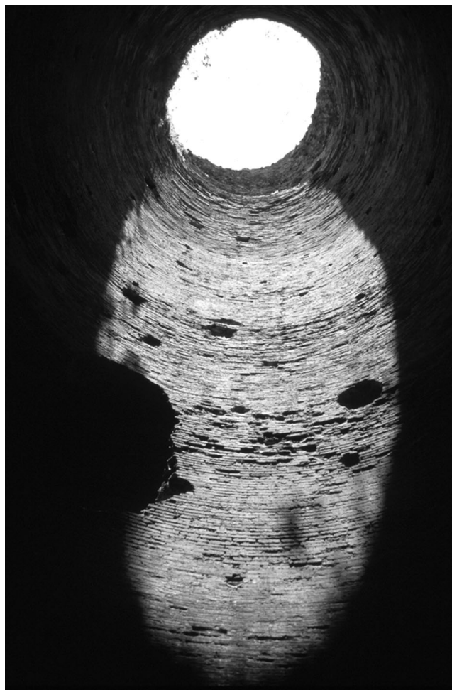
Fig. 3. The interior walls of the tomb of Caecilia Metella are lined with bricks made of roof tiles

Let us now turn to the introduction of fired brick in Rome. It has long been recognized that it was the combination of “thin” Roman bricks and concrete that led to the ultimate supremacy of brick construction. However, there are also noticeable similarities between the introduction of this technique and the early occurrences of “thick” Hellenistic bricks. There may be no direct link between them, but they represent a similar process. Just as in the case of the tombs at Seuthopolis, we may conjecture that fired bricks were introduced in Rome as the solution to a particular architectural problem.