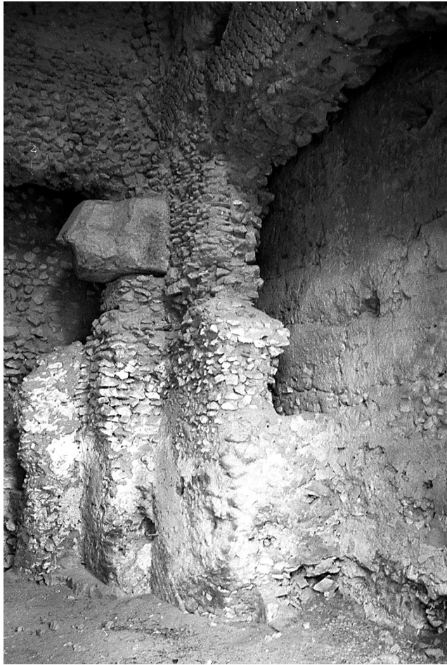
Fig. 4. One of the chambers in the tomb of Sempronius Atratinus at Gaeta, showing double interior walls with an intermediate space

extending all the way to the top of the building where it formed an earth cap or even a conical mound. This applied in particular to the circular tombs of the Augustan era. Although great pains were taken to drain away as much of the rainwater as possible, the earth fill easily became saturated, thus increasing the humidity in the concrete walls. As the water tried to escape through the surface of the interior walls, plaster, wall-paintings, and stucco relief crumbled. In one circular tomb belonging to the early Augustan period, the tomb of Sempronius Atratinus at Gaeta, the architect tried to prevent such damage by using double walls (Fig. 4). Moisture was ventilated away through the intermediate space before it could reach the interior surface. In the tomb of Caecilia Metella, the same effect was attained by another method. The use of fired brick as caementa and wall-facing reduced the permeability of the wall and increased the adhesive strength of the plaster. The brick walls of the tomb are bare today, but residual traces and nineteenth-century eyewitnesses testify to the presence of interior wall decoration.