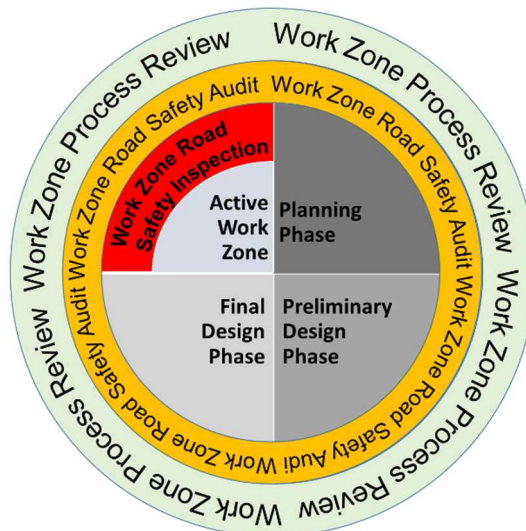
Figure 1. Types of Work Zone Safety Examinations. Based on ATSSA (2013).