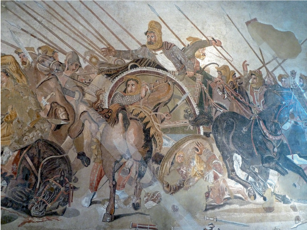
Fig. 2. Detail of the Alexander Mosaic, with Darius III in the centre. Museo archeologico nazionale, Naples.

of a kandys without a hood is that of a young Greek woman dressed in a kandys on a grave stele from Attica, 36 while most Persian images do not allow one to decide whether a hood was attached to the kandys or not.