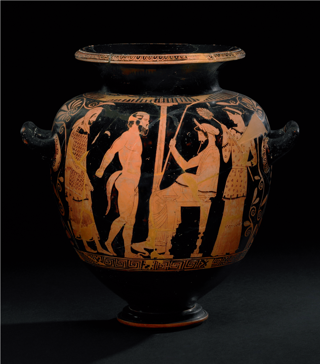
Fig. 5. King Midas as the Great King on a red-figured Attic stamnos from Chiusi, c. 450 BC. London, British Museum, inv. no. 1851,0416.9/E 447.

Let us now turn to the headdress Midas is depicted as wearing in the vase painting. According to the myth, he was supposed to hide his ears under a tiara , but in this scene he is not wearing the usual tiara , like the guard to the far left in front of him. It has been suggested that Midas is wearing a sakkos , 55 but I cannot see any reason why he would be depicted with a typically female head covering, 56 especially when the myth states that he wore a