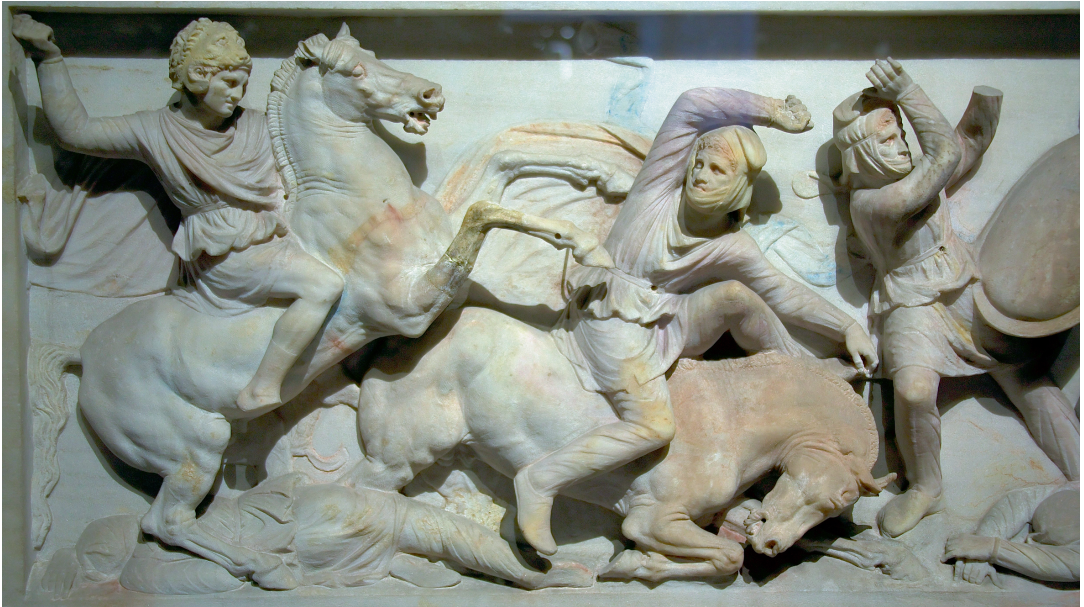
Fig. 1. Detail of the Alexander Sarcophagus. Alexander to left, and a Persian soldier dressed in riding dress (i.e. trousers, sleeved garment, kandys and Iranian headgear). Istanbul Archaeological Museum.

graphic material, we find that there are many variations of the cap. However, the kurbasia described by Herodotos may be compared with the stiff pointed caps worn by the so-called Scythian archers on Greek vases, especially in the black-figured ware. 9 In addition to these stiff pointed caps, there are also representations of soft and loose caps that are usually worn together with trousers and long-sleeved garments. This type appears frequently in the later red-figured ware and was plausibly intended to represent Persians rather than Scythians. 10 However, the distinction between these two groups is uncertain, and for our discussion it is sufficient to determine that in Greek as well as Persian images, both a pointed stiff cap as well as a looser soft cap were represented.