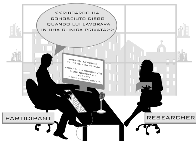
Figure 2. Experimental procedure for the speech production task (Studies II and III).