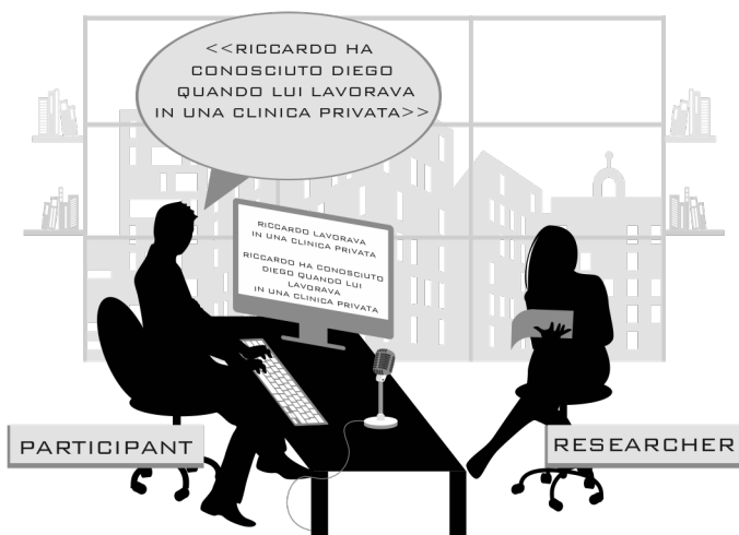
Figure 2. Experimental procedure for the speech production task (Studies II and III).