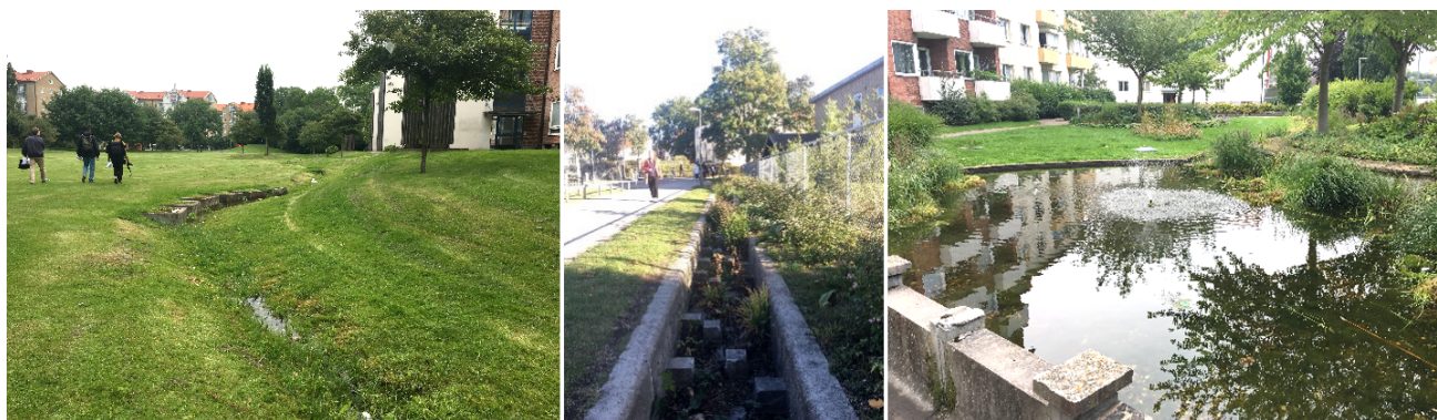
Figure 2. From left to right: Sunken lawn (part of Augustenborg remodelled park); one of the paved canals; one of the wet ponds.