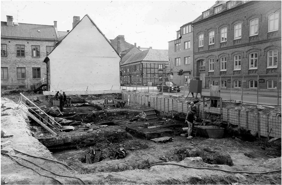
Fig. 2. The excavation of Gyllenkrok 30 in 1992.

The cellar is called A13 in the unpublished report and was dated to phase II, representing the High Middle Ages, by the excavating archaeologists. A rim sherd from a Siegburg stoneware vessel could be dated to 1300 based on a very similar type from Aulgasse, Siegburg (Beckmann 1975, 119f).