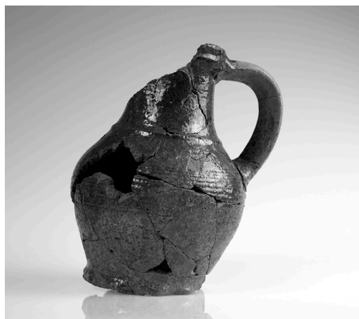
Fig. 3. A Scanian redware jug.

(although the production sites remain to be found). The Scanian jug dates to after 1300 in Kv. Apotekaren 4 in Lund (Johansson 2014, 25), from 1275 in Dalby (Lindahl 1986, 24) and 13th–14th century from Kv. Spritan, Åhus (Svensson 2005, 76).