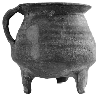
Fig. 4. A wheel-thrown reduced ware tripod vessel.

Since the cellar was dug in the Middle Ages the stratigraphy has been destroyed and fails to provide exact dates for the foundation of the house. However, the very small amounts of wheel-thrown reduced ware and hand-formed reduced ware ( kugeltopf ) which