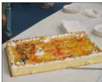
The celebration cake for the 50th anniversary of ICPE.

Poster sessions can be extremely useful, especially when there is a time and place to discuss the posters that researchers have given their effort and thoughts to produce. During this conference, the poster time was restricted to