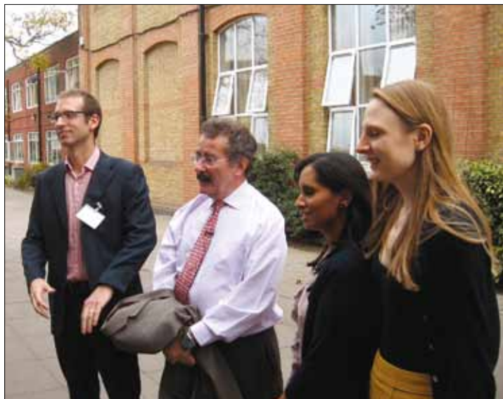
Lord Robert Winston at St Bonaventures School in November.

Professor Lord Robert Winston commented: 'We as researchers have a duty to act as positive role models for young people to help inspire them as they consider