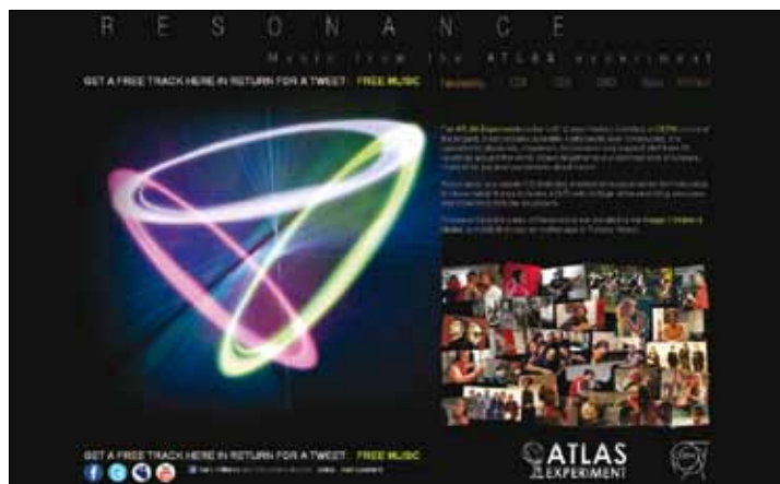
The Resonance CD showcases music recorded by scientists.

entists' own label, Neutralino Records, which is named after a hypothetical particle predicted by a theory called supersymmetry in particle physics, Resonance features 19 artists over two CDs and a DVD.