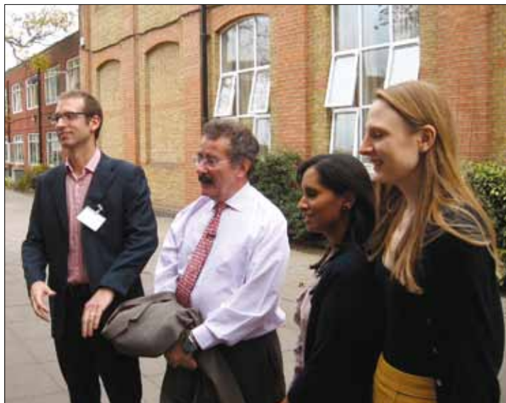
Lord Robert Winston at St Bonaventures School in November.

Professor Lord Robert Winston commented: 'We as researchers have a duty to act as positive role models for young people to help inspire them as they consider