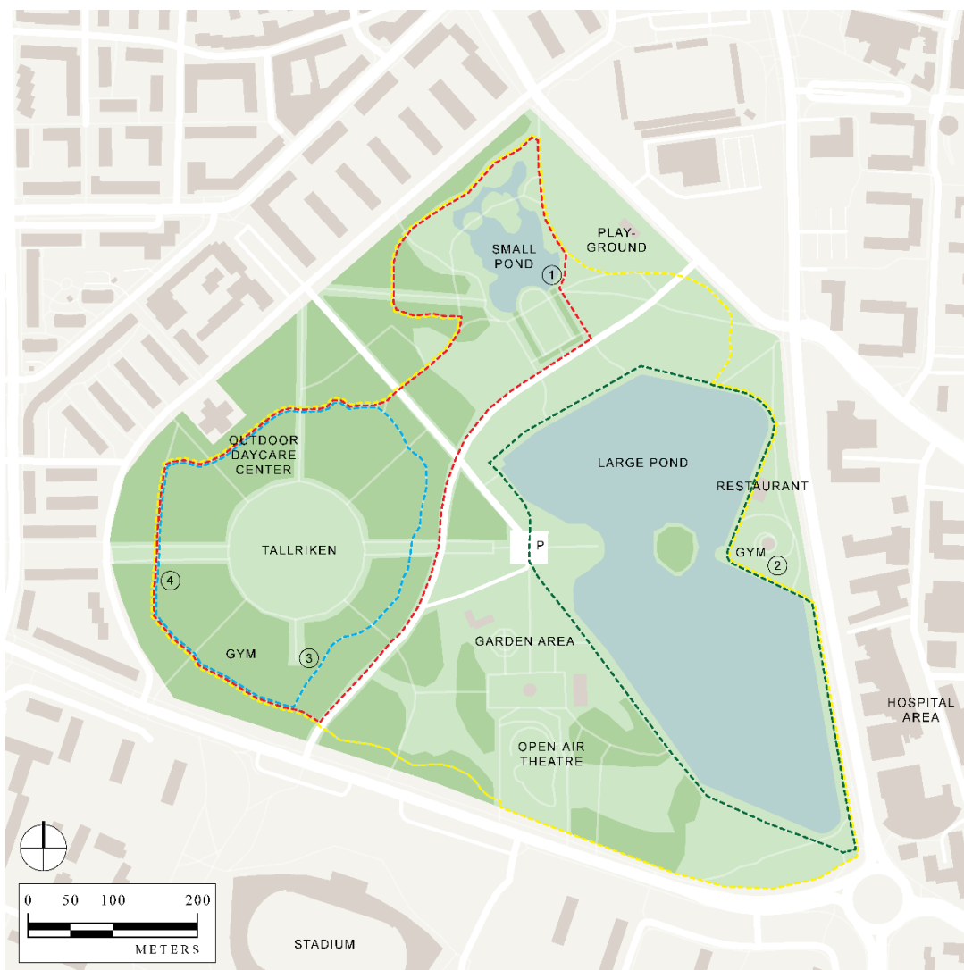
Fig 2. Map of Pildammsparken, including the three different running tracks (blue, red and yellow), Johan's route (green), and the observation spots (1-4). The map was constructed with the help of OpenStreetMap (and retrieved from http://www.openstreetmap.org , 2016).

( Friluftsteatern ), pavilions, playgrounds, outdoor daycare centers and boules courts. Pildammsparken attracts dog walkers, people feeding birds, families and groups having picnics or barbecues, and diverse forms of physical exercise. Professionally equipped tree-climbing, drone-flying and the location-based game Pokémon Go craze were spotted, and newly installed features include beehives and rental bikes. The park also stages the annual May Day Walpurgis bonfire celebration, midsummer festivities, concerts and many other events. In the last few years a camp of homeless migrants lived in the park, though this was dismantled before our study started.