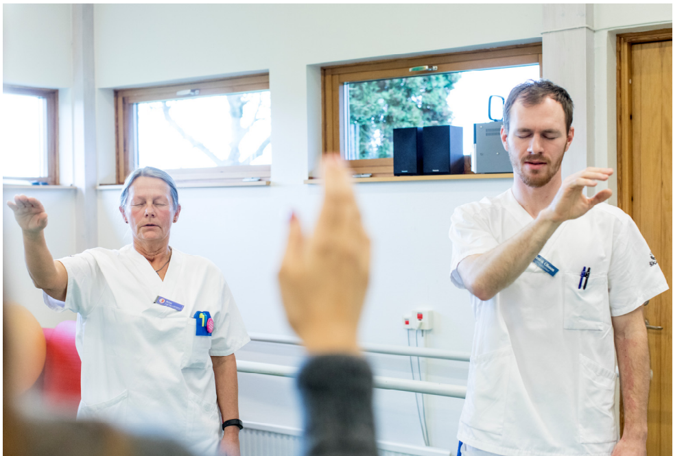
Picture II. Employees at one of the participating ICs engaging in a deep breathing exercise.

Throughout the intervention phase, all employees at the participating centres had the opportunity to influence and evaluate the recovery activities, by communicating with members of the inspiration group or leaving a note in an anonymous suggesting box. In addition, the whole employee group was given time to reflect on the project at workplace meetings, making joint decisions on how to move forward. This was a recurring event for the participating centres; scheduled once a month during the year of the intervention.