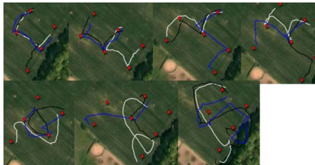
Fig. 2. Trails for 10°, 30°, 60°, 90° (top row), 120°, 150° and 180° (bottom row).

Looking at the three tests done on an open field we can see the trend quite clearly. In the top row of Fig. 2 we see the angles 10°, 30°, 60° and 90°. All these trails follow the intended path quite well, although we begin to see some deviations in the rightmost picture. In the bottom row of Fig. 2 we see the wider angles resulting in more deviations and finally also loops.