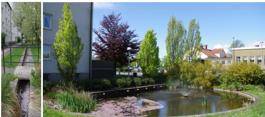
Figure 1. Canal and pond in Augustenborg.

In Augustenborg, a 31 hectares residential area, stormwater is controlled in LID system containing detention in ponds and areas for temporarily flooding, infiltration on green roofs, lawns and parking, as well as slow transport in swales, ditches and canals. The old combined sewers are still used for wastewater. The LID stormwater system was constructed by the end of the 1990s by VA Syd (utility company) and MKB (housing company) as a part of the project called Eco-City Augustenborg. For a detailed description of LID in Augustenborg, see Villarreal et al. (2004). Two pictures from the area are shown in figure 1. About 3,000 people live in the area in 3–6 storeys apartment blocks built in 1948–1952. The area continues to be developed and this year a 14-storeys building named Greenhouse is finished.