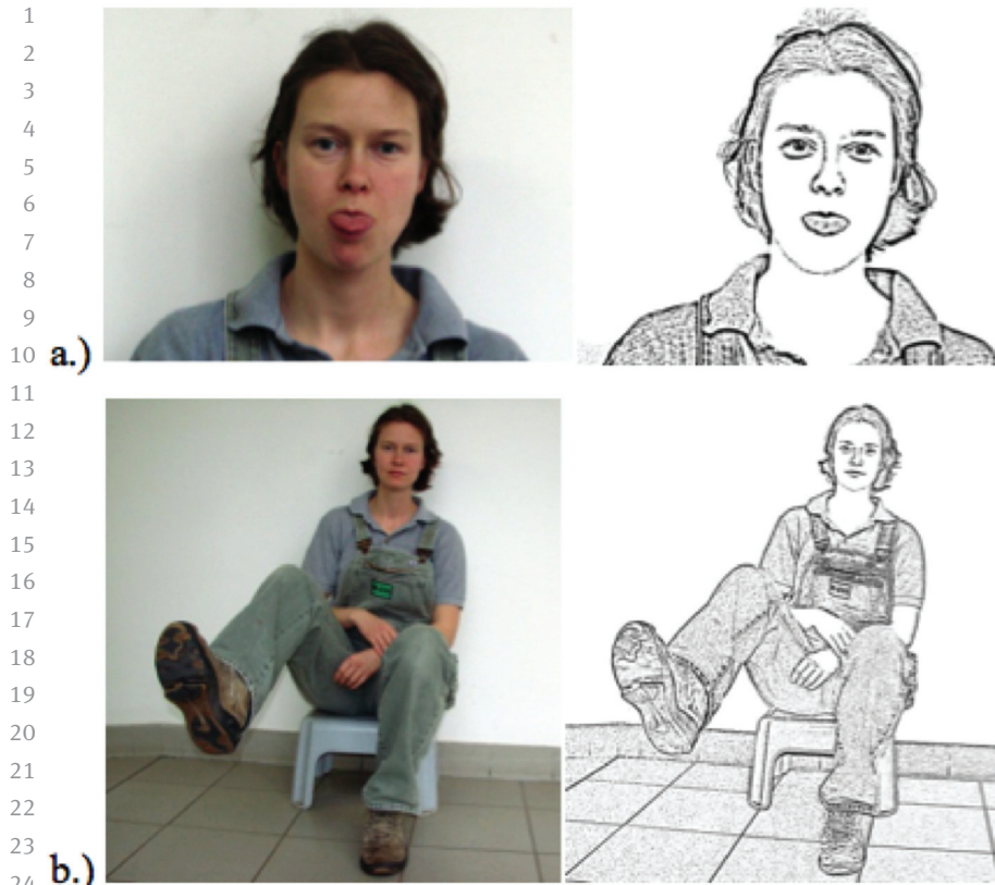
25 Fig. 2: Examples of the photos and drawings used in Experiments 1 – a photo and a drawing of 26 (left) Protrude tongue action, and (right) Raise foot action 27