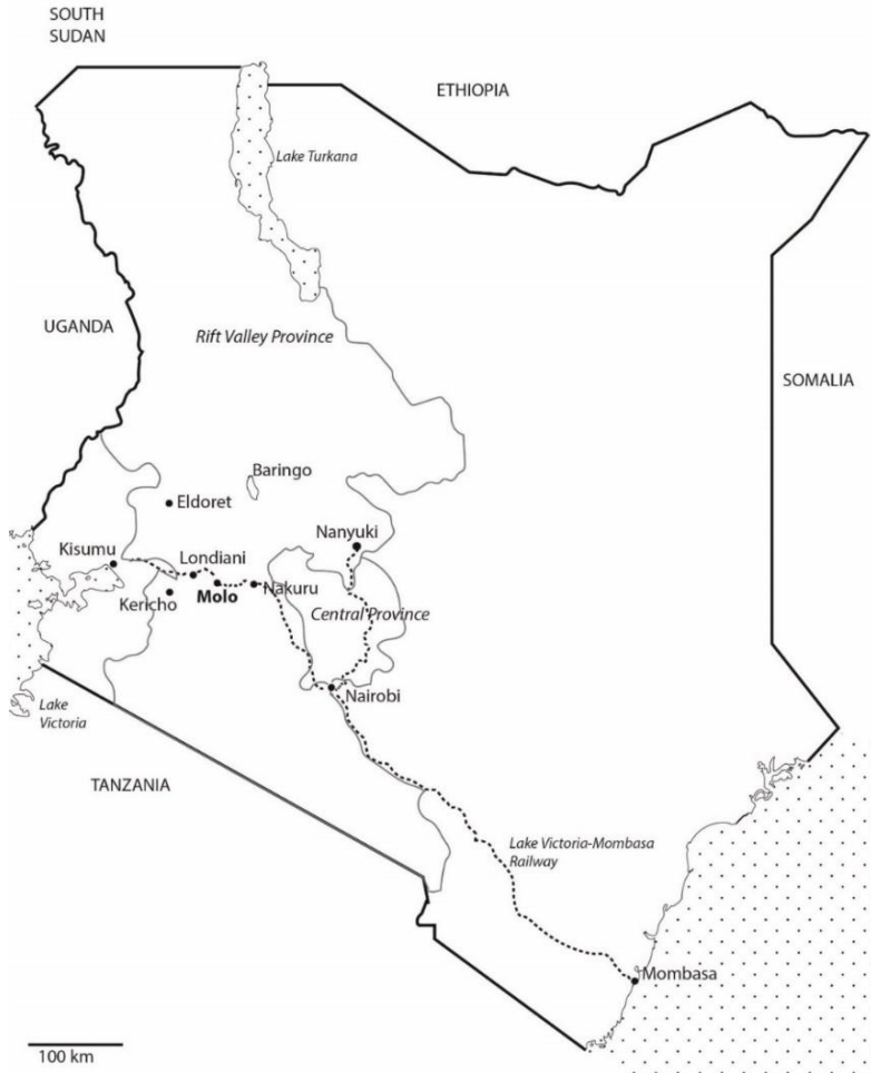
2

Molo is also linguistically diverse. Most of my narrators speak at least one of the two official languages of Kenya, Kiswahili and English. However, the majority would count either Kalenjin or Kikuyu, or one of the other