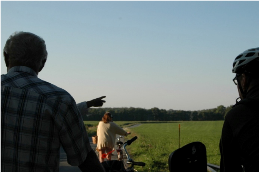
Picture 9 Guide's pointing hand

constantly changing as the event is presented in a new way. By being in line, the additional valuation proposition confirms the existing propositions. Here, the valuation propositions included are made stronger by additional elements that lead into the same direction.