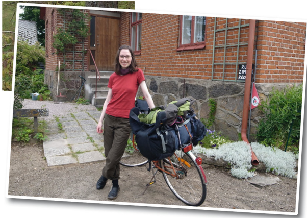
Picture 1 Ambassador leaning on the bike

In the Silenceville project single persons act as ambassadors for the biking trails. One example of an ambassador is the dissertation author's own participation in the promotion of the trails. The author was asked by the project manager to provide an interview for a regional tourism brochure. The interview was printed in the 2014 issue of the regional tourism brochure (picture 1).