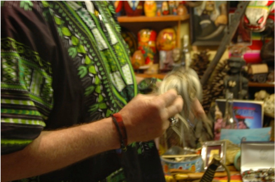
Picture 6 Shrunk head obtained at cannibal tribe