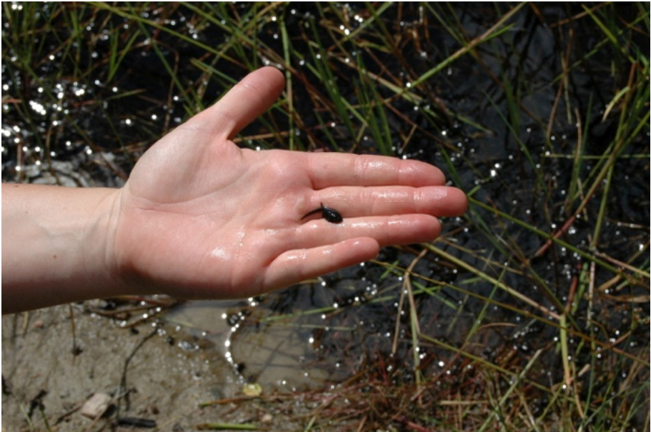
Picture 5 Tadpole found in the pond