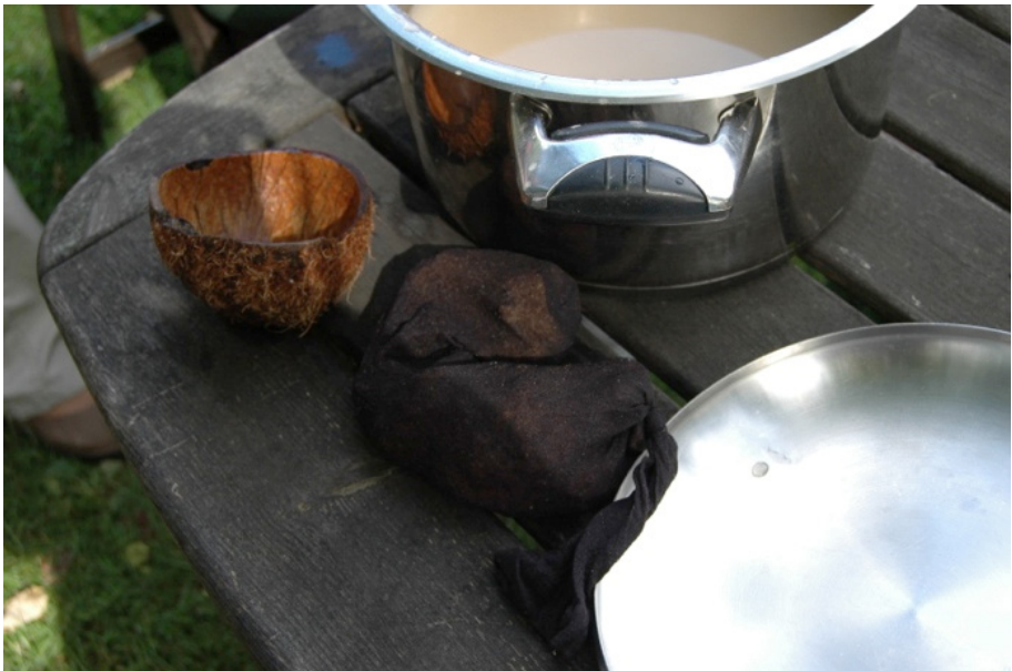
Picture 4 Kava drink prepared