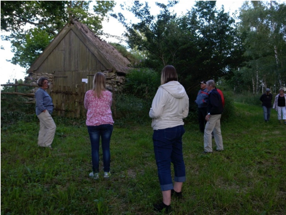
Picture 3 Group gathering in order to listen