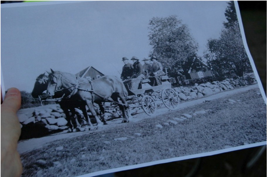
Picture 8 Picture of family

aspect of authenticity and the performed authenticity. The next section examines the new interpretations of sites established in the touristic offer.