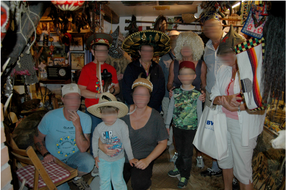
Picture 7 Souvenir picture taken at Titus' Cannibal museum