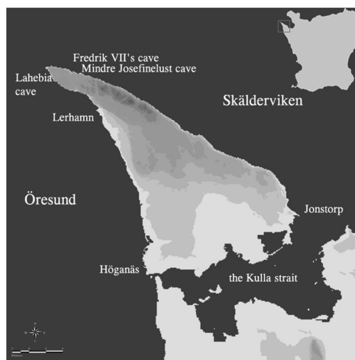
Fig. 1. The post-glacial island with key names mentioned in the text.

Over the millennia the geomorphologic features in the peninsula underwent considerable changes. 1 During the deglaciation around 16,000 BP the marine limit was as high as 85 metres over today's sea level. Kullaberg emerged as a small arctic island in the Kattegatt Sea. In a small fen, a bone of a polar bear was found, first described by Sven Nilsson (1860), and later analysed and radio-carbon-dated to 14,500 BP (Berglund et al. 1992). Due to the land upheaval a larger peninsula was formed 12,000 BP and the shore level was situated 10 metres below the present