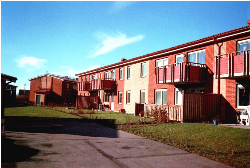
Figure 1. Case study. 'Erlandsdal 1b'. Svedala.

A modern building with uncomplicated geometrical layout and ventilation and heating system was selected in order to focus on the comparison between calculated and real energy performance. It was one of eight similar two-floor blocks with eight flats each comprising a 520 m 2 net floor area, located in Svedala in the south of Sweden and owned by the semi-public company Bostads AB Svedalahem. See Figure 1. The building was completed in 1998.